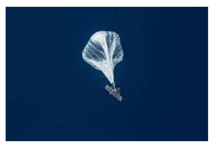
Fig. 4. Project Loon Balloon HAPS