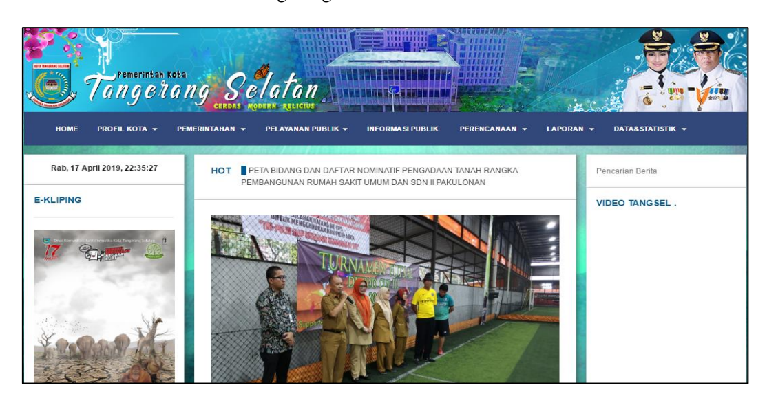
Figure 3. South Tangerang Facilities and Infrastructure

Implement KM system is done by doing a screenshot of the South Tangerang system. Here are some views of the South Tangerang system. Figure 3 shows the facilities and infrastructure of the South Tangerang area.