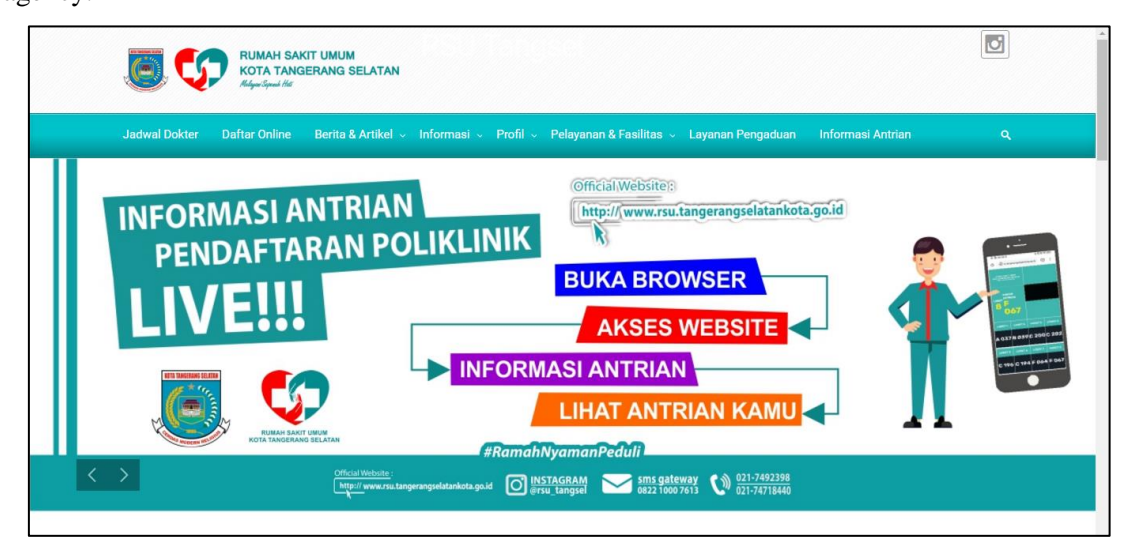
Figure 5. Public services in the form of hospitals

Figure 5 is a picture of public services integrated with the South Tangerang web. On this page the public can register online in advance, and see the schedule of doctors who practice. The evaluation in this study was carried out with the SUMI (Software Usability Measurement Inventory) questionnaire. The results of the questionnaire displayed in this study with 10 respondents in the category of the general population of South Tangerang. The categories used for the questionnaire are effectiveness, efficiency and satisfaction. The linker used in the questionnaire is SS (Strongly Agree) ie multiplied by 4, S (Agree) multiplied by 3, TT (Don't Know) is multiplied by 3, TS (Disagree) is multiplied by 0. The overall result with the formula 2.5 times total . So that it is stated that if the whole SS box becomes 100, then the total totals are sorted from the smallest to find the Median. Table 2 is the effectiveness table, Table 3 efficiency and Table 4 Satisfaction with the South Tangerang information system. Table 5 is the result of a median calculation of effectiveness, efficiency and satisfaction.