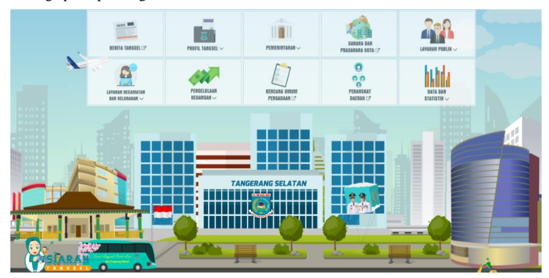
Figure 2. Starting page of the South Tangerang web

The characteristics of users of the South Tangerang Information System in the general public. The sampling technique of respondents is using snowball sampling technique. The sampling technique is initially small in number, then this sample directs his friends to be sampled as well so that the sample becomes large [18]. The author uses respondents as much as 10. In this study only displays the results of the general public questionnaire. The South Tangerang web page is www.tangerangselatankota.go.id. Figure 2 is the initial display page of the web of design principles in general.