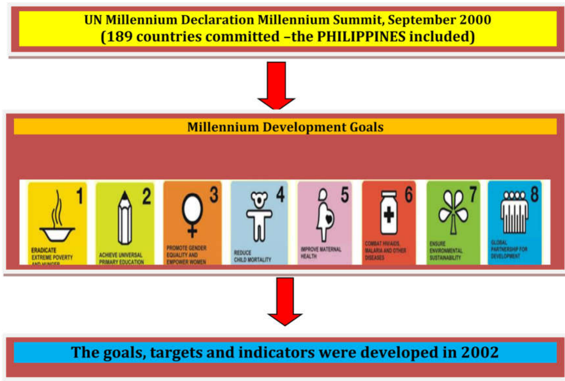
Figure 1. Formulation of MDGs

Table 1 reflects the MDG indicators categorized as high, medium and low where indicators under high category need to be addressed immediately, followed by those in the medium and low category.