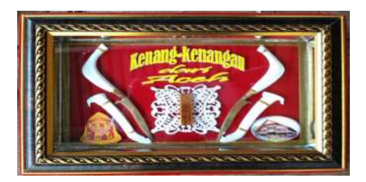
Figure 4. Rencong blades placed within a frame traded as a souvenir

The blades obtained from simple casting method were produce in relatively short time (Figure 3a). To produce a blade of rencong, the craftsmen only required approximately for three minutes, which was much shorter-time compared to the time needed to produce a single blade by traditional casting metal techniques with one hour. The Figure 3b shows the finishing process manually by hands, and the Figure 3c displays the results of the finishing process. The marketing steps are not only sold in form of a souvenir, but also in a single blade. The following Figure 4 shows a souvenir form of rencong a blade, which is traded in local market.