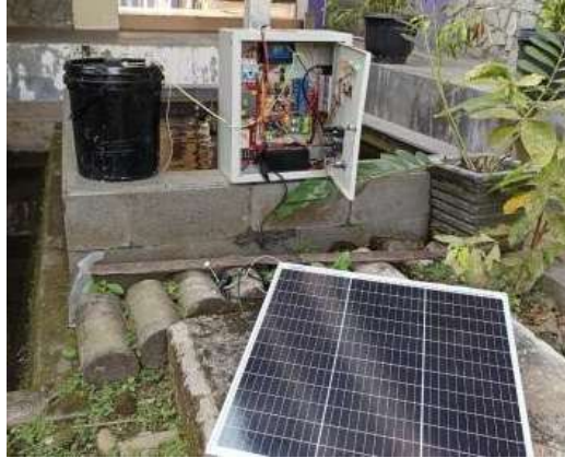
Figure 1. Experimental setup of the solar-powered IoT-based automatic fish feeding system

The proposed system consists of a solar-powered energy subsystem, a sensing subsystem, a control unit, and an actuation mechanism, designed to operate in an integrated and autonomous manner. The primary power source is a 50–100 Wp solar panel connected to a Maximum Power Point Tracking (MPPT) charge controller to optimize energy harvesting under varying irradiance conditions. MPPT technology ensures the solar panel operates at its optimal voltage and current, maximizing energy conversion efficiency even under partial shading or fluctuating sunlight intensity. The electrical energy generated is stored in a 12V battery to ensure continuous operation, particularly during low-light conditions or at night. The integration of solar energy into aquaculture systems has been shown to improve sustainability, enhance energy independence, and reduce reliance on conventional power sources, especially in remote or off-grid aquaculture locations. In addition, solar-powered systems have been reported to significantly reduce operational costs over time while maintaining reliable performance for IoT-based applications. The experimental setup is given in Figure 1.