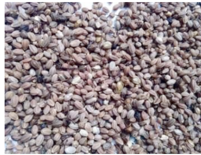
b. Extracted seed