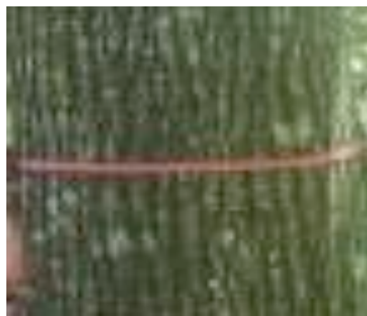
c. Bark fissure on mindi