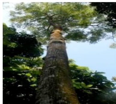
d. Mindi tree

Figure 1 Morphological performance of fruit (a), seed (b), bark (c), and tree (d) observation on Petiole character, fruit and leaf of mindi in three population presented in Table 2.