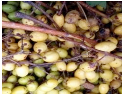
a. Fresh fruit

[13]. The Mindi tree may grow to be 45 metres high. When young, its bark is smooth and greenish-brown, and as it ages, it becomes grey and fissured (1c). Mindi fruit is a small yellow drupe that is roughly spherical and is approximately 15 mm in diameter. It is smooth and shrivelled, with a slightly meaty texture (1a). The seed is oblongoid (1b), approximately 3,5 mm x 1,6 mm, smooth, brown, and coated in pulp.