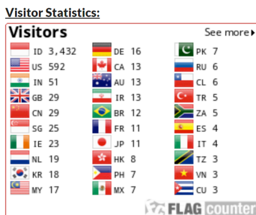
Figure 2 Statistic of the visitors or readers of JSI