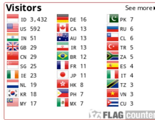
Figure 2 Statistic of the visitors or readers of JSI