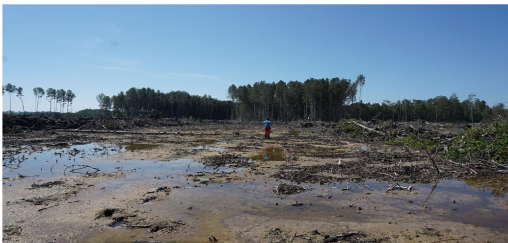
Figure 4 Mangrove forest damaged due to paddy field clearing in Hunduhon Village

Poverty is a source of inspiration with different strategic programs for various organizations, such as community social organizations, and government, to overcome poverty issues. The existence of resources would be sacrificed at the place where the program is applied to realize the strategic programs carried out by the government. Mangrove forests are one of the sacrificed resources in Luwuk Timur, Banggai Regency. Currently, the government has launched a labor-intensive program to meet the needs of the people for rice, by converting mangrove forests to rice fields.