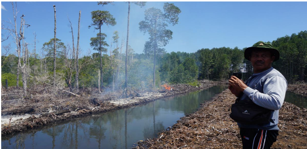
Figure 2 Mangrove forest clearance by the community in Hundohon Village

The economic condition of people below the poverty line demands they meet their daily needs by annexing the surrounding mangrove forests by clearing mangrove forest land for traditional aquaculture purposes [18]–[20]. The mangrove forest area decreased because the community clear the forest and did not replant it in a location that can still be planted, then the existing mangrove stands has been suffered enormous damage [15]–[17].