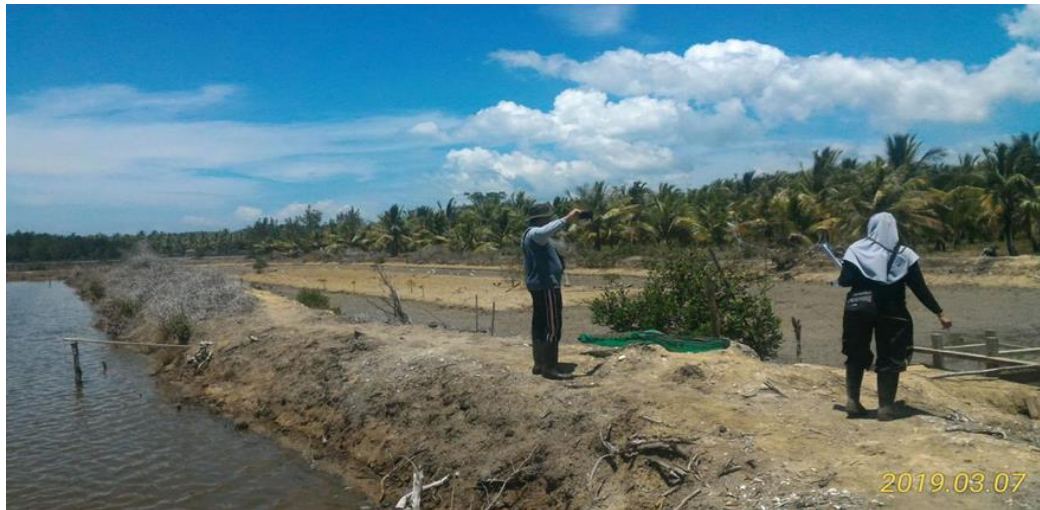
Figure 3 Clearance of pond land by companies in Uwedikan Village

Increasing the number of industries and settlements requires the opening of new land, in particular coastal mangrove forest areas. Some have converted into residential and industrial areas. It can directly cause ecological impacts that threaten the sustainability of different coastal biota that make habitat for mangrove forests and can physically eliminate the role of mangrove forests in preventing coastal abrasion [10], [11], [48]. A special attraction for investors to do different businesses is the conversion of mangrove forest land to become land for the aquaculture industry and one of them is shrimp commodities.