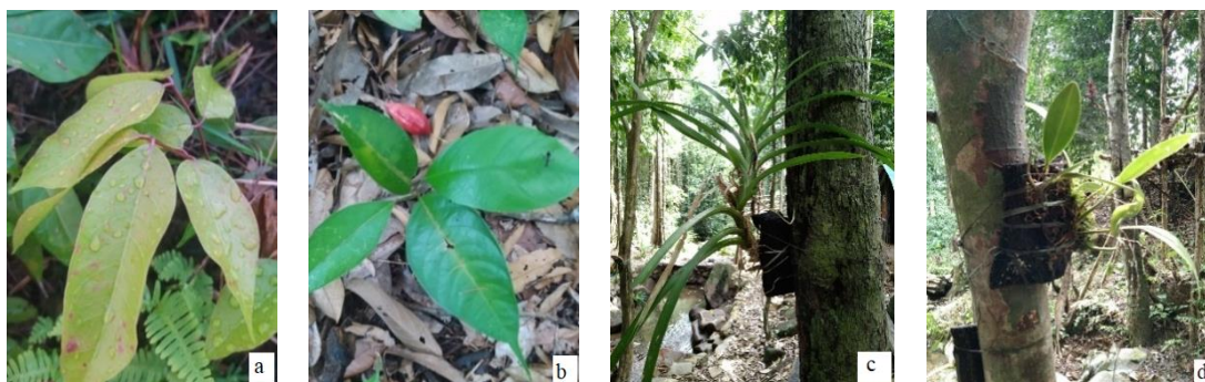
Figure 3 Camping area and Orchid Park vegetation: (a) jengkol ( Archidendron pauciflorum ), (b) madang marukuwung/tagula ( Litsea sp), (c) cane orchid ( Grammatophyllum speciosum ), (d) moon orchid ( Phalaenopsis bellina )

Based on direct observation in the field at the Sepancong Hill campsite, 17 species were found with a total of 664 individuals, while in Orchid Park, 26 species were found with a total number of 648 individuals. Orchid is dominated by the Madang marukuwung plant.