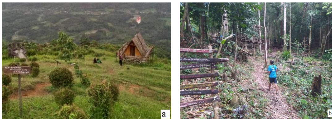
Figure 2 Sepancong Hill nature tourism (a) camp area, (b) Orchid Park

result, the Orchid Park area is 2475 m 2 , while the camping space in Sepancong Hill is 6334 m 2 ). Sepancong Hill is a tourist destination located in Pungo Hamlet, Cipta Karya Village, Sungai Betung District, Bengkayang Regency, West Kalimantan Province. It was inaugurated in March 2020 by BUMDes Panyanggar. In this study, the carrying capacity of tourism for Sepancong Hill was assessed using two different tourist destinations which are the Sepancong Hill camp area (Figure 1a) and the Orchid park tourist spot (Figure 1b). It is located at the foot of Sepancong Hill.