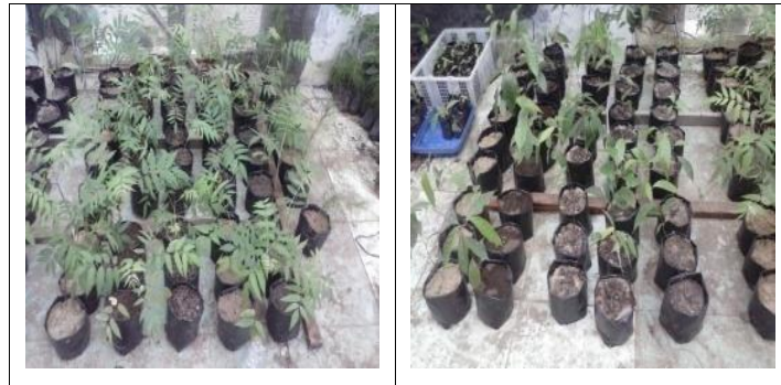
Figure 1 The diversity of kemenyan toba and suren seedlings on various growing media

Description: values followed by the same letters in the same column are not significantly different at 95% confidence levels in accordance with Duncan's multiple range test.