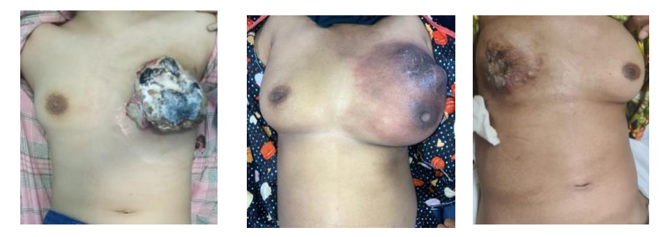
Figure 1. Data collection of Patients with Breast Ca at RSUP HAM Medan

characteristics, tumor characteristics, biomarker status, recurrence of metastatic brain tumors based on Magnetic Resonance Imaging (MRI) examination, and data on therapeutic regimens in cases of brain metastases of breast cancer. ER and PR status were determined by immunohistochemical examination. the intensity of the HER2 3+ immunohistochemical staining was considered positive.