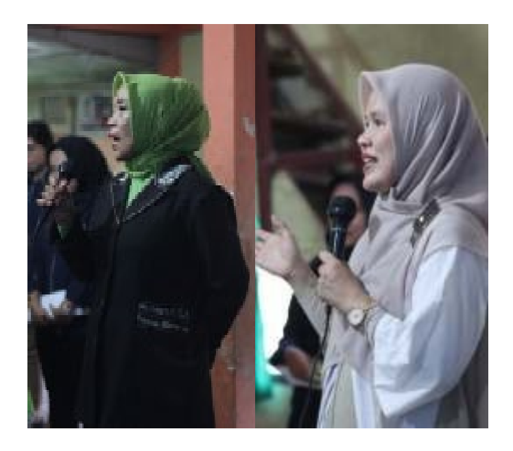
Figure 3. Opening remarks from the Principal of Al Ikhlas Elementary School and the head of the service team