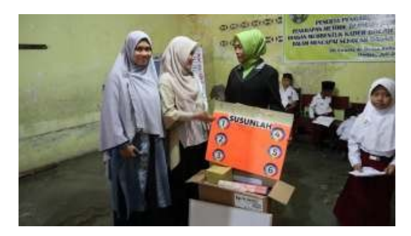
Figure 4. Handover of a set of "Bersabar" methods Games

Before the game started, the participants were asked to do the pre-test questions as shown in Figure 5 first. The service team also invited participants to sing the PHBS song. After the conditions and situation of atmosphere building have been successfully carried out, participants are asked to take a lottery number for group division and introduce themselves first as shown in the Figure 6. Participants with the same lottery number will become 1 group. Furthermore, the service team will explain the SD-BS snakes and ladders game guide as shown in Figure 7.