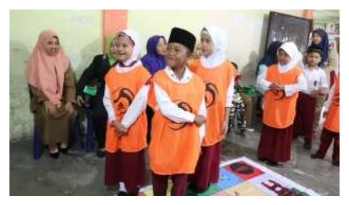
Figure 8. The game starts cheerfully

After the playing activities were completed, cadres conducted a post-test to determine the extent of their knowledge after the training intervention with the "Bersabar" method as in Figure 9. Ten cadres who have received training intervention with the "Bersabar" method will be officially inaugurated as the Environmentalist Child Cadres. They are directed to become agents of change who will socialize clean and healthy living to other friends, school residents, and families. In addition to the inauguration, the best cadres will be rewarded for playing and learning. Each cadre will also be given a pin badge and a gift. Pin badges are given to cadres to increase their confidence so that they can be optimal in campaigning for clean and healthy living and other students will also be interested in joining the next cadre. The cadres will also be given posters of clean and healthy living behavior as campaign materials for the cadres. As their duty as the Environmentalist Child Cadres, they must campaign for clean and healthy living with the help of PHBS posters.