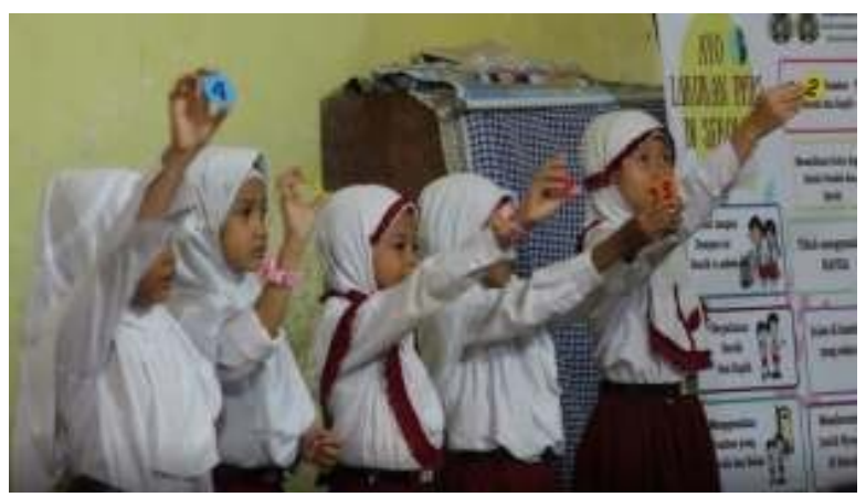
Figure 6. The cadre candidates take serial numbers randomly