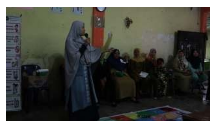
Figure 7. The service team explains the game procedure

Then the game begins where 2 people in each team play the role of dice thrower and pawn. The dice thrower throws the dice and the pawn will step on the snakes and ladders board as many times as the number of dice eyes that come out. The team that stops right in the PHBS content picture box, will get a question according to the picture. The team that answers correctly gets a score of 100 and the wrong one will not get a score. At the end of the game, there are two best teams, namely the team that gets the highest score and the team that reaches the last city on the snakes and ladders board first.