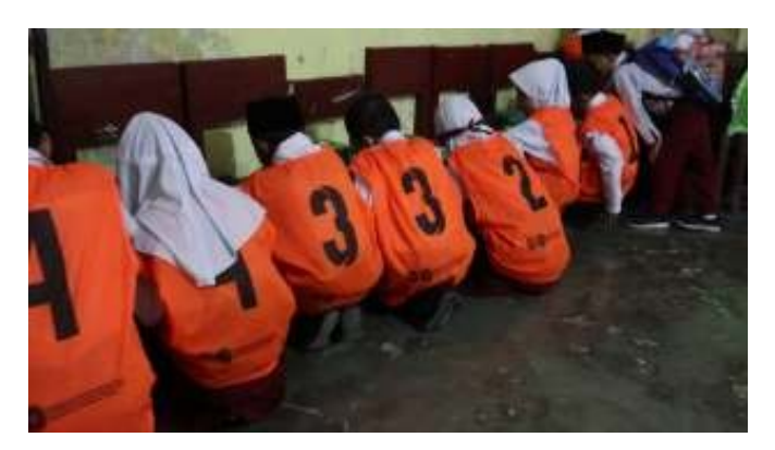
Figure 9. The cadre candidates working on post-test questions

After the playing activities were completed, cadres conducted a post-test to determine the extent of their knowledge after the training intervention with the "Bersabar" method as in Figure 9. Ten cadres who have received training intervention with the "Bersabar" method will be officially inaugurated as the Environmentalist Child Cadres. They are directed to become agents of change who will socialize clean and healthy living to other friends, school residents, and families. In addition to the inauguration, the best cadres will be rewarded for playing and learning. Each cadre will also be given a pin badge and a gift. Pin badges are given to cadres to increase their confidence so that they can be optimal in campaigning for clean and healthy living and other students will also be interested in joining the next cadre. The cadres will also be given posters of clean and healthy living behavior as campaign materials for the cadres. As their duty as the Environmentalist Child Cadres, they must campaign for clean and healthy living with the help of PHBS posters.