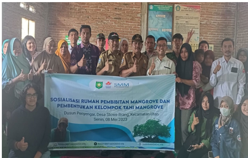
Figure 5. Conducted socialization of mangrove nursery program

Figure 4 shows outreach the program to the Stowe Barang Village Apparatus, related to the mangrove nursery program. Village apparatus and the Stowe Brang Community are ready to participate in the mangrove nursery activities for 6 months, and then the Stowe Brang Village has provided 1 are of land for a nursery.