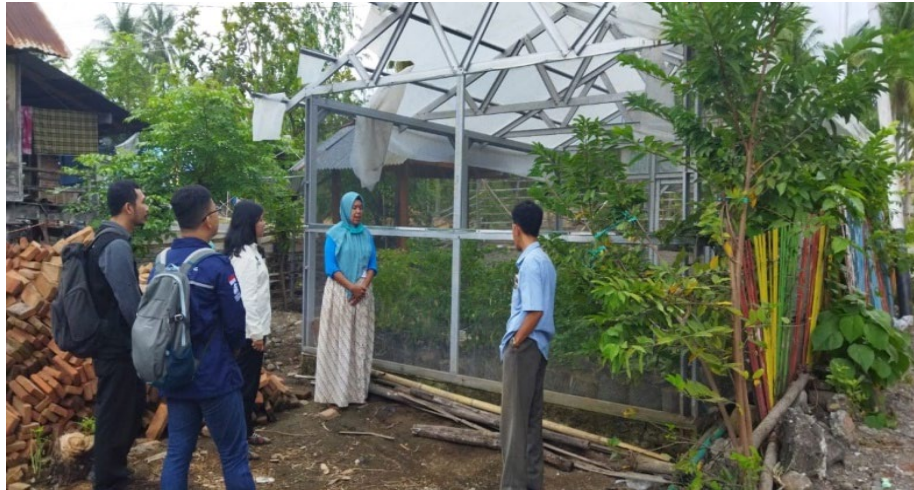
Figure 4. Outreach the program to Stowe Barang Village apparatus

Figure 3 shows outreach to the Department of Fisheries and Maritime Affairs (DKP) and the Environment Agency (DLH), Sumbawa Regency related to the mangrove nursery program. DKP fully supports mangrove nursery activities in Utan sub-district, they recommend several mangrove species for breeding, at least Rhizophora and Sonneratia and DKP also will try to help find consumers. DLH fully supports also for mangrove nursery activities in Utan sub-district and is ready to collaborate, according to DLH Every pond industry in Sumbawa is required to carry out a greenbelt, one of which is planting mangroves, so DLH can recommend each pond industry to buy mangrove seedlings in nursery land in Utan sub-district.