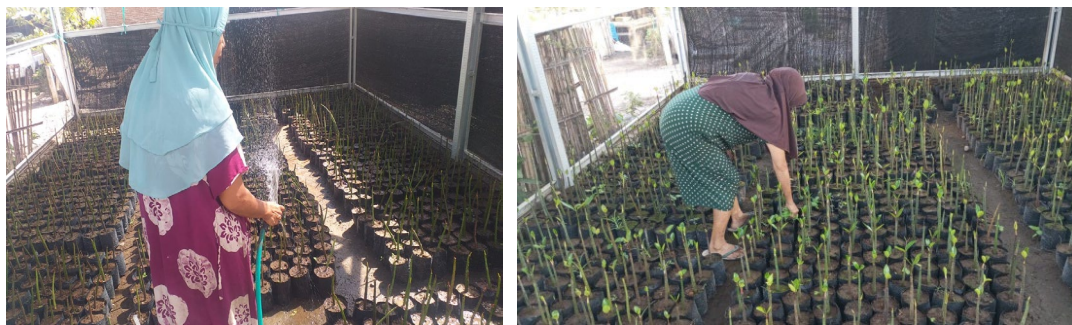
Figure 8. Maintenance of mangrove seedlings

Mangrove conservation activities play a pivotal role in maintaining and protecting the sustainability of coastal ecosystems. These activities need to be integrated and effective to address the complex ecological, social, and economic factors that impact mangrove habitats.