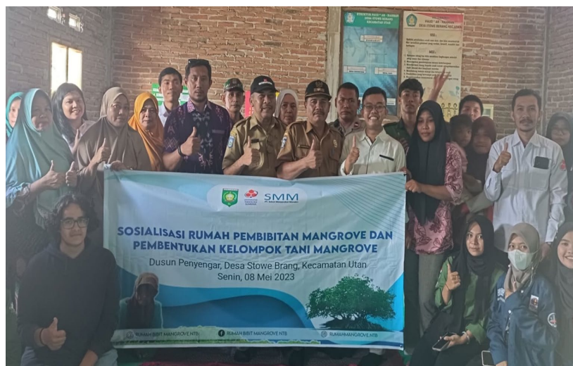
Figure 5. Conducted socialization of mangrove nursery program

Figure 4 shows outreach the program to the Stowe Barang Village Apparatus, related to the mangrove nursery program. Village apparatus and the Stowe Brang Community are ready to participate in the mangrove nursery activities for 6 months, and then the Stowe Brang Village has provided 1 are of land for a nursery.