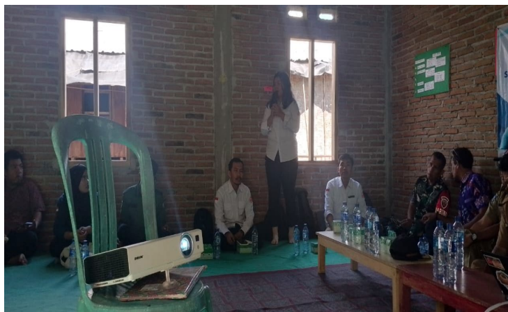
Figure 7. Establishment of a farming group

The development of a mangrove nursery business transcends beyond economic gains; it embodies a harmonious relationship between environmental conservation and community development. By nurturing and restoring mangroves, we contribute to the overall health of our planet's coastal ecosystems. Simultaneously, we empower communities with sustainable livelihoods, creating a blueprint for enterprises that balance ecological well-being and economic progress. As we forge ahead with this venture, we demonstrate the profound impact that innovative business models can have in addressing pressing environmental concerns while fostering prosperity.