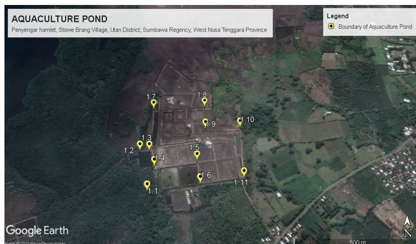
Figure 1. Maps of mangrove nursery project

The implementation of mangrove nursery activity as environmental efforts in aquaculture Pond area, located in Penyengar hamlet, Stowe Brang village, Utan sub-district, Sumbawa regency, West Nusa Tenggara province. The map of the proposed project location is below.