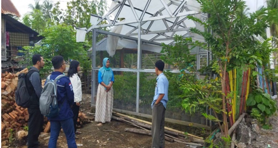
Figure 4. Outreach the program to Stowe Barang Village apparatus

Figure 3 shows outreach to the Department of Fisheries and Maritime Affairs (DKP) and the Environment Agency (DLH), Sumbawa Regency related to the mangrove nursery program. DKP fully supports mangrove nursery activities in Utan sub-district, they recommend several mangrove species for breeding, at least Rhizophora and Sonneratia and DKP also will try to help find consumers. DLH fully supports also for mangrove nursery activities in Utan sub-district and is ready to collaborate, according to DLH Every pond industry in Sumbawa is required to carry out a greenbelt, one of which is planting mangroves, so DLH can recommend each pond industry to buy mangrove seedlings in nursery land in Utan sub-district.