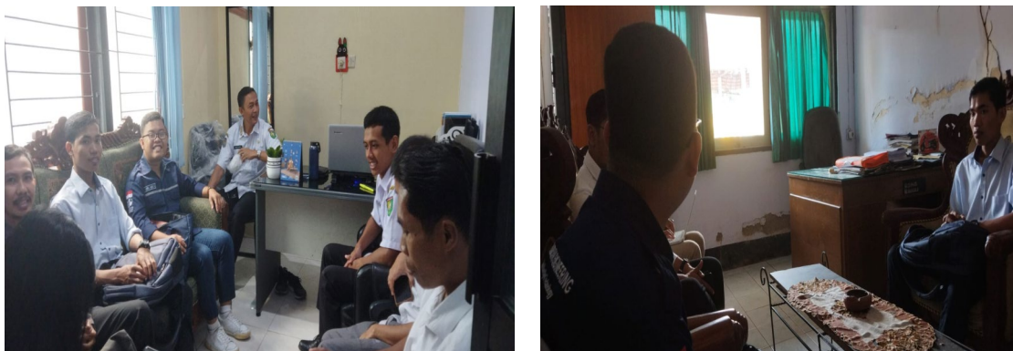
Figure 3. Outreach thr program to the Fisheries and Maritime Service (DKP) and the Environment Agency (DLH), Sumbawa Regency

Various biological and human systems depend on mangrove ecosystems, which have a vital and varied role to play in protecting the environment [7]. Tropical and subtropical climates are home to these distinctive coastal habitats, which are frequently found along intertidal zones where land and sea converge [8]. According to [9] here are some crucial details emphasizing the value of mangrove ecosystems: biodiversity, carbon sequestration, coastal protection, economic value, water quality and etc. To implement it, we need support and cooperation from various parties, such as the Environment Agency and the Sumbawa Regency Maritime and Fisheries Service. The following figure is a socialization activity for mangrove nurseries to several local government agencies in Sumbawa Regency.