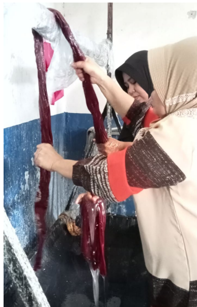
Figure 8. Soaking cloth