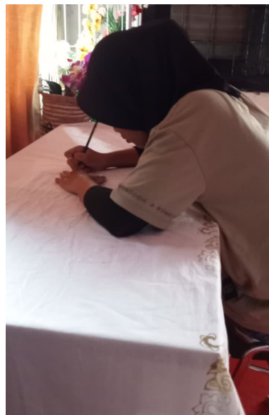
Figure 5. Drawing batik

This batik training activity lasted for 7 days at the Prima Jaya Batu Bara Batik Industry House. The batik training process goes through several quite lengthy stages, starting from cutting the cloth, writing and drawing on the cloth, the process of heating the canting, dyeing the cloth with the canting, to the finalization process at the final stage by drying the results of dyeing the cloth.