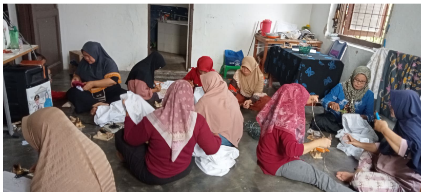
Figure 6. Training “mencanting” batik