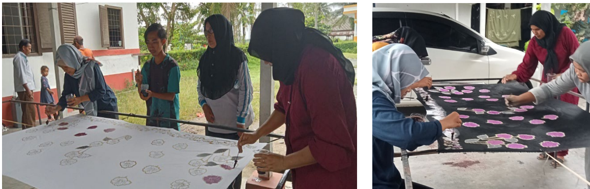
Figure 9. Finalization