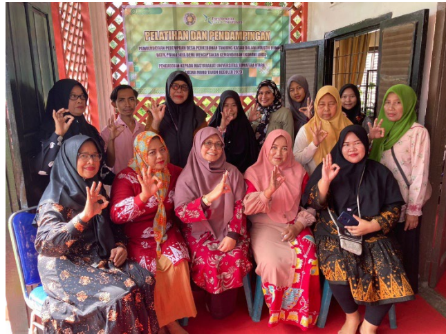
Figure 4. Applicant with the training participants

students who have not continued their education to college, girls who don't go to school, and so on. This community service will be carried out on October 27 2023 at the Prima Jaya Batu Bara Batik Industry House.