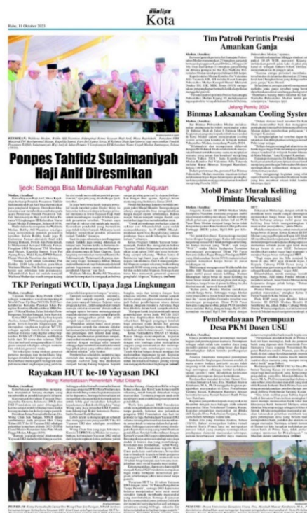
Figure 3. Mass Media Publication

The implementation of community service with the title Empowering Village Women through Home Industry Batik Prima Jaya to Create Local Economic Independence has been published in print and online mass media in one of the daily newspapers Analisa print edition dated 11 th October 2023