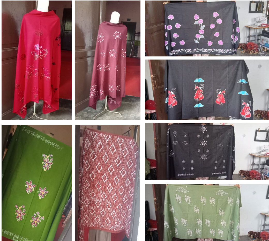
Figure 10. Results of Batik Training at the Prima Jaya Batu Bara Batik Industry House