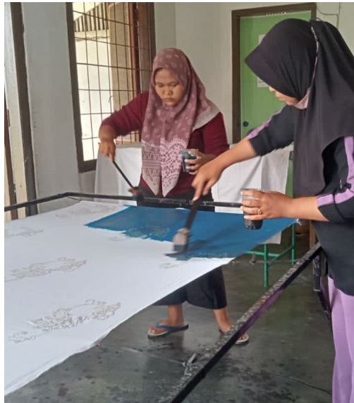
Figure 7. Colouring