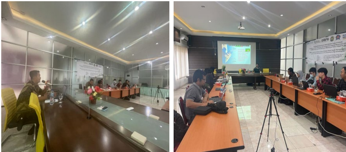
Figure 2. SEM, SEO, SMM Training

This pattern of providing technological assistance and problem-solving is carried out in the form of mentoring, handing over business tools, and training - routine training will be carried out, one of which is assistance in creating websites and social media content and how to optimize startup income.