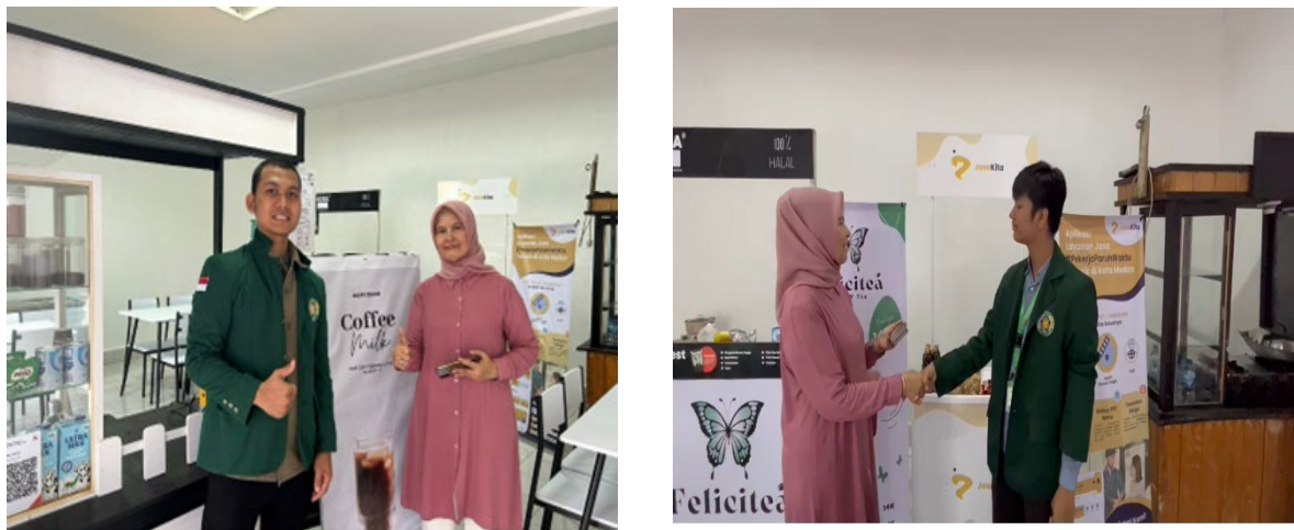
Figure 3. Delivery of business materials and technology

This pattern of providing technological assistance and problem-solving is carried out in the form of mentoring, handing over business tools, and training - routine training will be carried out, one of which is assistance in creating websites and social media content and how to optimize startup income.