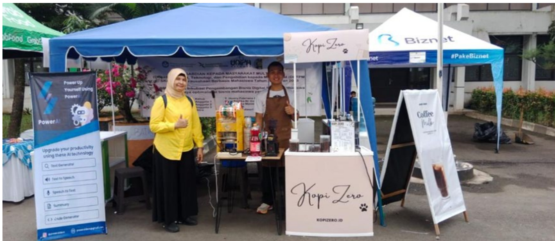
Figure 5. Implementation of student business