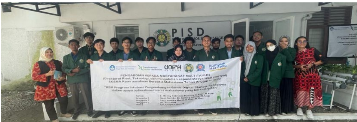
Figure 4. Group photo of student business