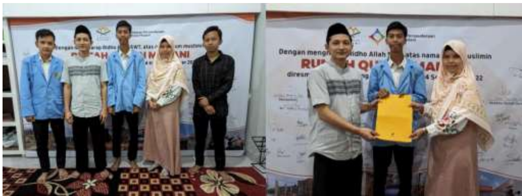
Figure 2. Partner Site Visits