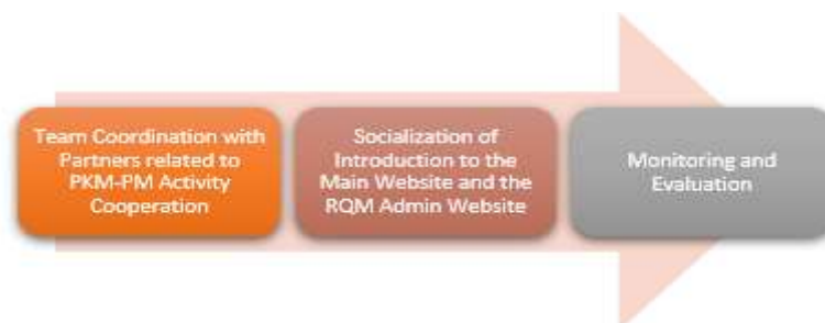
Figure 1. Flow Diagram of Implementation Method

The implementation stage of the Community Service Student Creativity Program with the title Knitting the Qur'ani Generation with Science and Technology Innovation and Creative Media "Rumah Qur'an Madani" in Building Connections with the Qur'an in the Digitalization Era will be carried out carefully and structured to achieve the targets that have been set, ensuring that each activity runs according to plan and have a positive impact on participants and the community.