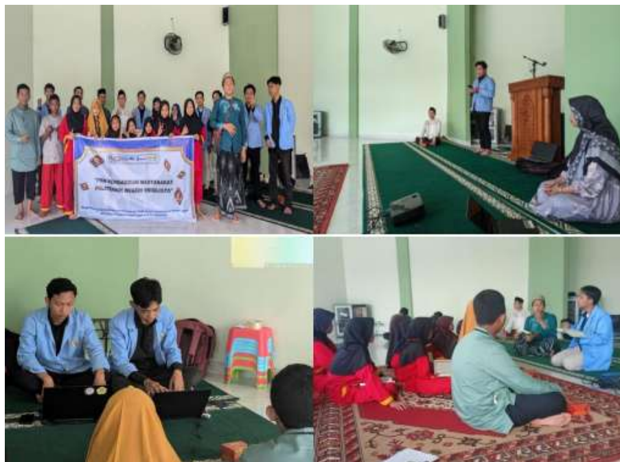
Figure 3. Implementation of Socialization Activities