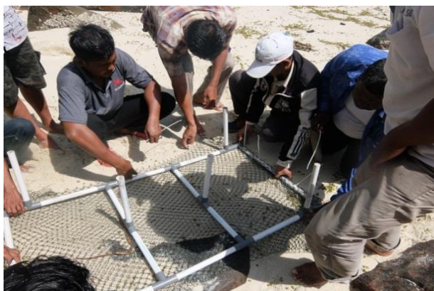
Picture 2. Transplantation shelf assembly

This stage is the process of assembly of transplantation shelf that have been prepared from Medan with the condition of the pipe already contains dough of sand and cement that has been dry. When the process of assembling the transplantation shelf took place, also explained about the tools and materials used and how to make it. Measure of transplantation shelf is 0.5 X 1 m rectangular shape with high of feet 30 cm for stick on the bottom of water. Top of shelf stretched with nylon net to place the substrate.