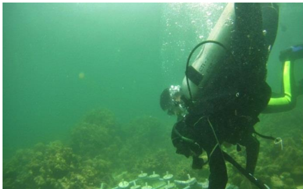
Picture 5. Laying of Transplantation Shelf.

After the binding process is complete, the transplantation shelf are placed at the bottom of water with a depth about 5 m. Transplantation shelves are placed amounted to 5 pieces.