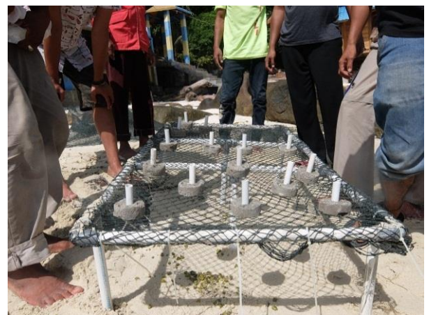
Picture 3. Substrate placement on transplantation shelf

Substrate used in the transplant is concrete (cement) with measure of diameter was 10 cm and a thickness was 3 cm. Substrate is equipped with a buffer (pipe diameter was 2 cm and the length was 10 cm) in the middle as a place of attachment of transplants and two holes to place the binding of plastic clamps.