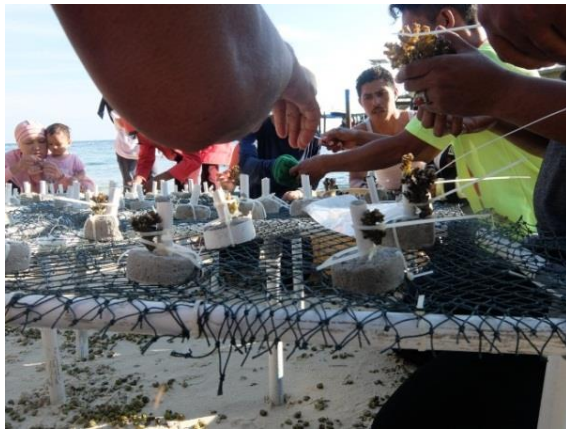
Picture 4. Binding of Coral Seeds