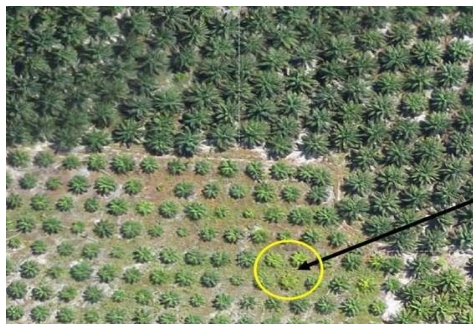
Figure 6. Palm oil Plantation captured by Drone

The palm oil image data obtained from the drone type DJI phantom type is shown in Figure 6.