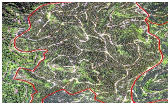
Figure 3. Example of Orthophotos mapped by UAV

Image or photo interpretation is an action to examine a photographic image for the purpose of identifying the object and assessing the significance of the image or photograph. Image interpretation is a process of recognizing objects in the form of images (images) for use in certain disciplines such as geology, geography, and other disciplines (Figure 3).