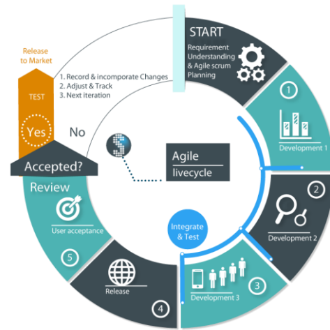
Figure 4. Agile Software Development Lifecycle

For the manufacture of orthophotos processing and analysis applications as well as guarantor of product quality, we use the Agile methodology as shown in Figure 4.