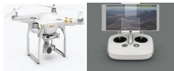
Image data retrieval is done by UAV / Drone type DJI 3 type Phantom (Figure 5)