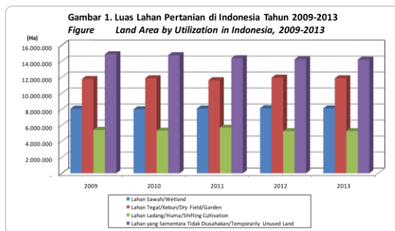
Figure 2. Statistic of farmland in Indonesia

In this study, we utilized Unmanned Aerial Vehicle (UAV) to get geospatial orthophotos for monitoring oil palm plantations. The aim is to check the growth of oil palm plants from the beginning, in order to identify which part of the plantation land is fertile for planted crops which mean to grow perfectly, less fertile in terms of growth but not perfect, or not growing at all. This information can be known quickly by the using of UAV geospatial orthophotos.