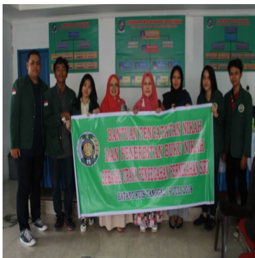
Figure 3. Community Service Team

obtained from the Head of KUA, Batangkuis Subdistrict and Kadhi Nikah from each partner village. While the weaknesses found in this service are the emergence of several obstacles related to time constraints. In addition, other aspects are the difficulty of the participants to leave their jobs and the distance of the house is quite far from the place of activity, so that it is difficult to bring the trainees in a larger number. Paying attention to the purpose and benefits of this extension activity is to increase the knowledge and insight of the community, especially for couples who are going to get married in understanding the marriage law applicable in Indonesia in connection with marriage registration activities and understanding the legal consequences that will arise for married couples without carrying out marriage records, the implementation of this extension activity was quite successful. This can be proven from the responses of the counseling participants who were very enthusiastic in asking questions in the question and answer session on counseling materials that were poorly understood. In addition, the village government through the Village Head requested that on another occasion a legal counseling team from the USU Faculty of Law / LPPM would come back to provide counseling for the community in the village.