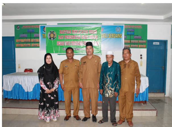
Figure 6. Community Service Team with Head of KUA, Village Head and Kadhi Nikah