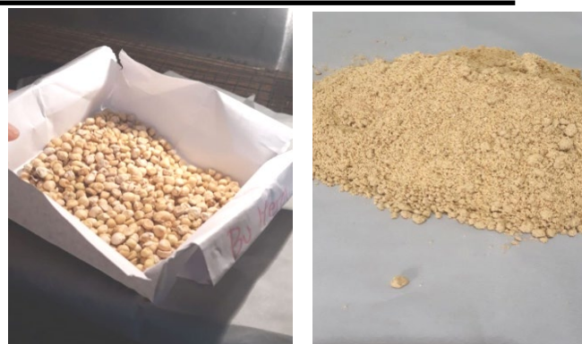
Fig 1. Dry particles and dried moringa powder

The seeds are blended until smooth so that they form powder. Then dried until there is no water content left. After that the process of making Moringa dye powder can begin. The dried powder is weighed as much as 2-3 grams and then put into a teabag container. Then glued using a hand sealer. Put in each box 25 packs. Ready for consumption.