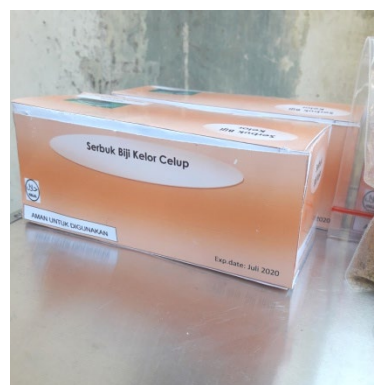
Fig 2. Moringa powder dipped