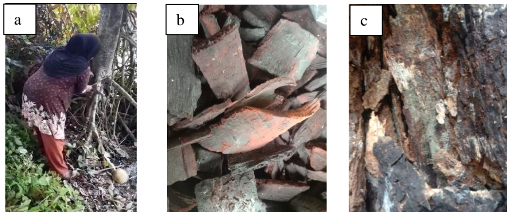
Figure 1. (a) The process of extracting mangrove bark, (b) Ceriops tagal bark, (c) Evolving bark ( Sonneratia alba )

Types of wood that can be used include flourish ( Sonneratia caseolaris ), Rhizophora apiculata , Rhizophora mucronata , Rhizophora stylosa , Avicennia marina , Bruiguiera gymnrhiza , Bruguiera parvifolia , Avicennia marina , Avicennia alba , Tengar ( Ceriops tagal ). Each type of tree will produce a different color. The type of dye that we will use as desired. To be able to produce a stronger color, usually the bark taken is the bark from the lower area of the tree near the roots to the first branch on the tree. If the uyang branch is above the resulting color is less strong or less bright. The following is the process of taking mangrove bark.