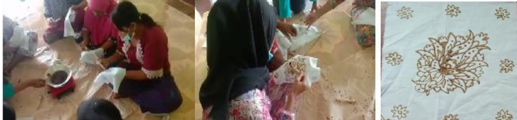
Figure 3. Canting proses

Preparation before chanting is to preheat the wax at a temperature of 60 to 70 degrees Celsius on the canting stove. After the wax has melted, it is craved for a while, and in warm conditions, it is pressed. Cutting is done carefully so that it looks neat in accordance with the previously made pattern. Pengantangan aims to draw a pattern on the cloth. The embroidery process on written batik takes a long time. The wider the fabric to be painted, the longer the working process will be.