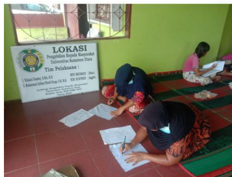
Figure 2. Making a written batik pattern

Pattern making on written batik is done by drawing the cloth first according to the desired motif. What is needed for drawing is an ordinary pencil. In basic training, written batik is made on a handkerchief size. Motifs made according to the wishes of group members are pictures of leaves, flowers, sea horses, dolls, and pictures of abstarik. It takes a long time to make written batik on 2 meter shirt pattern because of the wide size of the cloth.