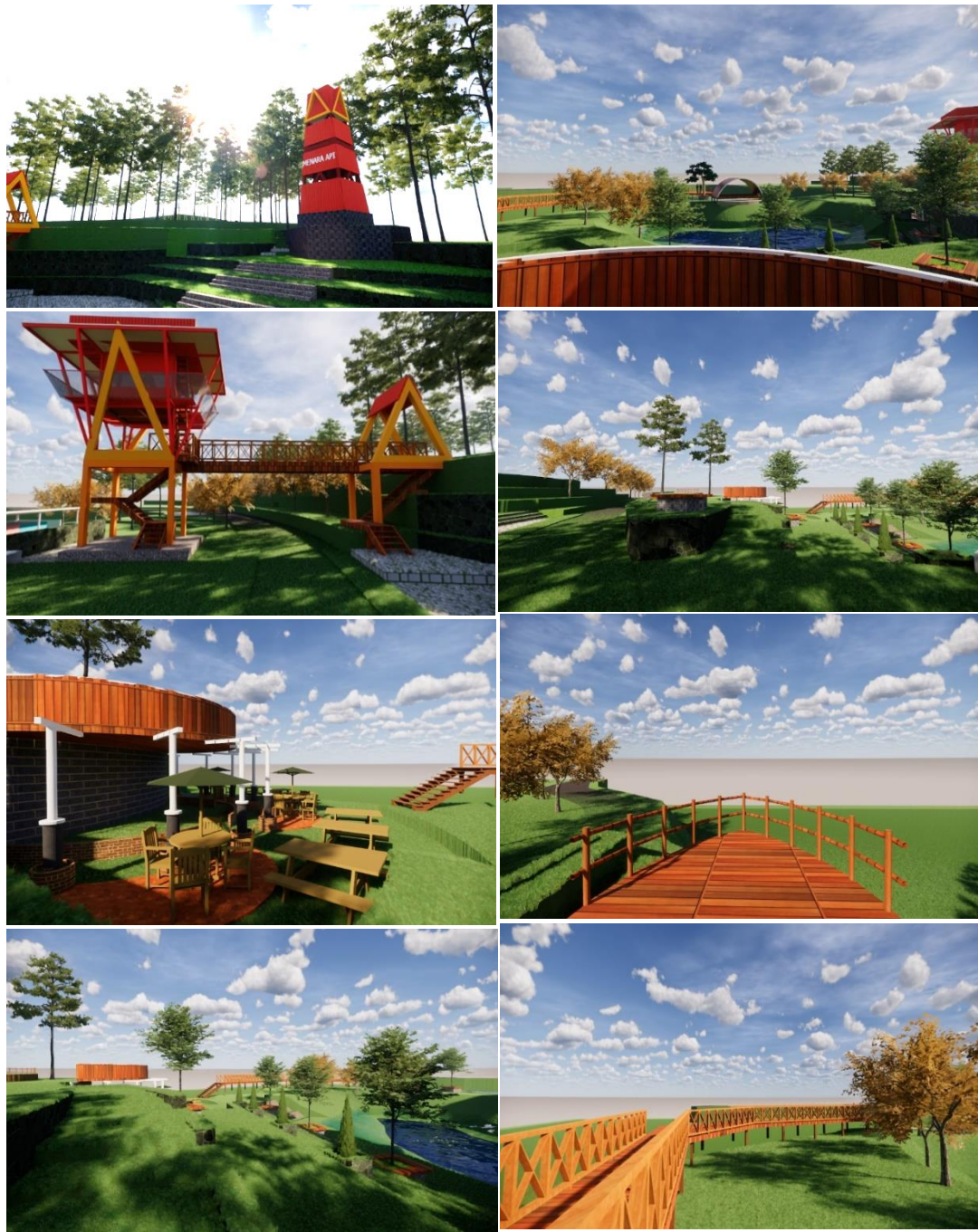
Figure 4. A pictorial design of the facilities in the tourist site Puncak Menara Api

The first picture in the pictorial design (a three-dimensional design) in Figure 4 is a “welcome” monument. This is very important to show the local people’s friendliness to all visitors coming to Puncak Menara Api. As this is the first construction in the tourist site that will be seen by visitors, it should be well-designed. The shape, the color, and the accompaniment construction around the monument should reflect the attractiveness of the site. The same design also applies to other facilities, such as bridges, parks, shelters, pools, and others.