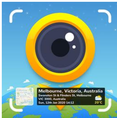
Figure 1. GPS Map Camera application

By using the GPS Map Camera application, the location coordinates of Puncak Menara Api in Gunung Saribu Village are obtained as shown in Figure 2.