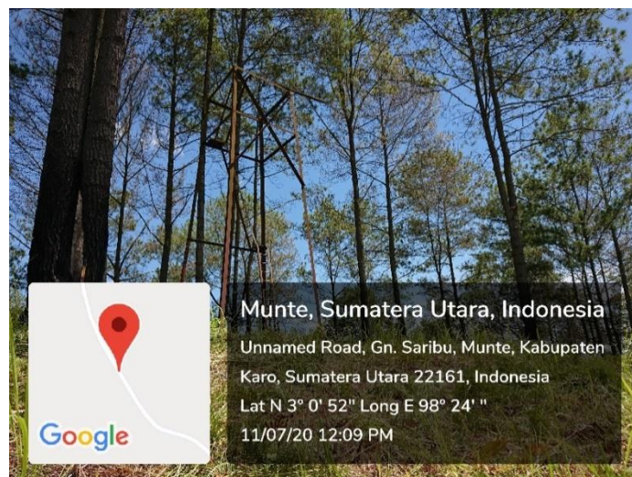
Figure 2. The location coordinates of Puncak Menara Api in Gunung Saribu Village

By using the GPS Map Camera application, the location coordinates of Puncak Menara Api in Gunung Saribu Village are obtained as shown in Figure 2.