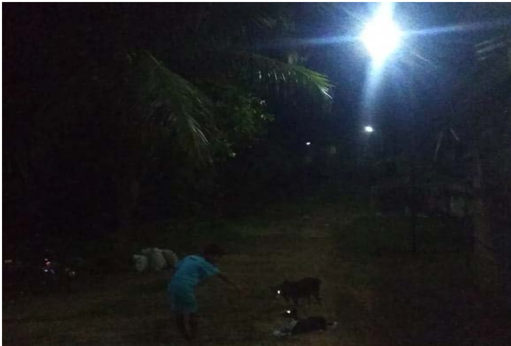
Figure 3.2 PJU lighting equipment assembled by the USU Community Services Implementation Team

installed using a lot of chips and electronic devices inevitably becomes a spectacle for all citizens of society. To illuminate the neighborhood, The Community Services Implementation Team installed 8 units of public street lighting light poles. Each pole is fitted with an automatic solar cell public street lighting lamp with 80 watts of power that will illuminate the residents' environment from late afternoon until early morning. In order to make it easier for residents, the lighting system uses auto flash which allows the lights to turn on if there is no sunlight, and will turn off automatically in the morning. In the morning the system will automatically charge the battery for charging which will turn on the lights at night. And so on this system works.