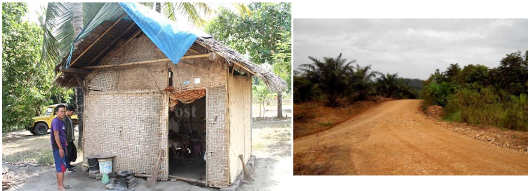
Figure 1.1. House conditions of members of farmer group members who live in areas close to their garden / agricultural areas without electricity facilities (left); The road to the settlement of members of the two farmer groups without lighting is prone to threats of crime at night (right)

The absence of public lighting inevitably also creates security vulnerabilities. Therefore residents are not free to travel for this reason. Residents complained about the need for public street lighting at certain points to reduce potential criminal acts that may arise due to dark access roads to and from their respective homes at night. Therefore, until now residents have anticipated it by not going out / coming home too late to reduce the risk of robbery on the street.