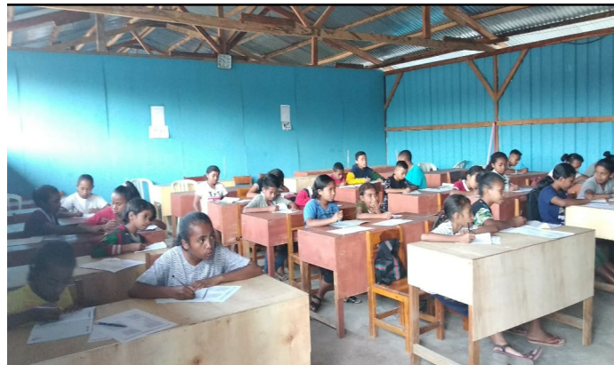
Picture 3.1. Introducing English Grammar and Vocabulary by Direct Method