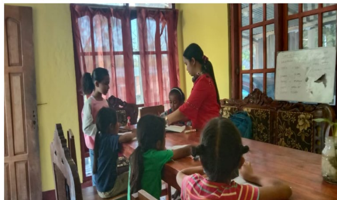
Picture 3.2. Students learn English grammar and vocabulary