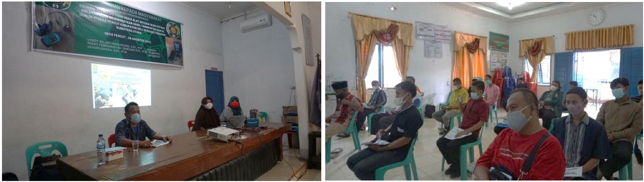
Figure 2. Dissemination of Materials and How to Operate Fishfinder

The direct practice activities begin with the activation of the fish finder and the introduction of several important buttons that are used when fishermen detect the presence of fish, followed by the opportunity for fishermen to operate the fish finder and read the catch of waves reflected on the seabed and then displayed on the monitor.