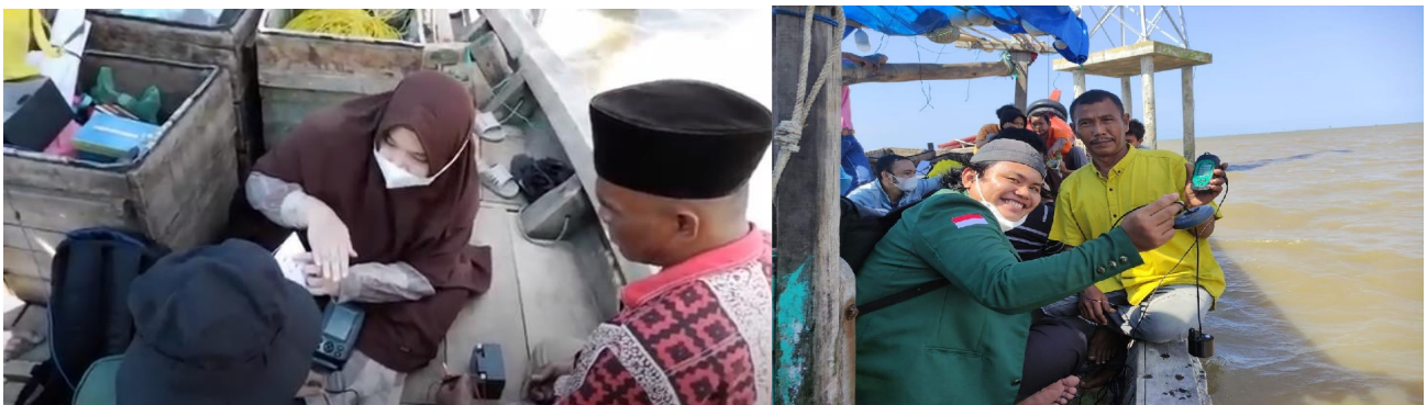
Figure 3. Simulation of Fishfinder Operation for Fishermen on Boat

The direct practice activities begin with the activation of the fish finder and the introduction of several important buttons that are used when fishermen detect the presence of fish, followed by the opportunity for fishermen to operate the fish finder and read the catch of waves reflected on the seabed and then displayed on the monitor.