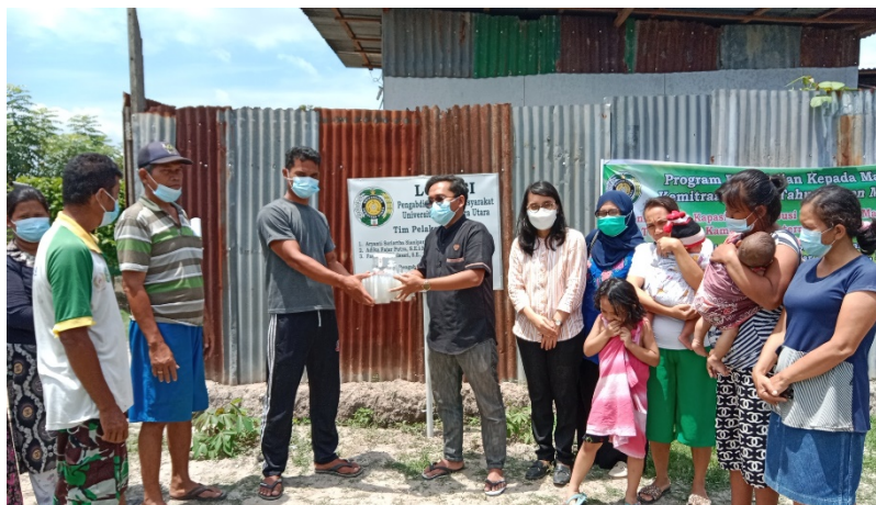
Figure 4. The participant received the tools provided

One of the problems experienced by the majority of MSMEs is the lack of understand the brand as a function to maintain the sustainability of its business. Most MSME business people are still focused on trading/sales and forget the brand side. This can be caused by not understanding the knowledge of marketing strategies and the benefits of attractive packaging and never received assistance. Therefore, for the second training material, the next speaker gave: marketing strategy materials through brands and packaging for SMEs especially for business partners. Materials about this brand will help business partners how to make a suitable brand for your business. Training on strategy This brand will guide partners in designing a suitable brand and product packaging for business partners. This brand building strategy training will create a brand for business partners to be able to compete in the form of products cake as a specialty from the field later.