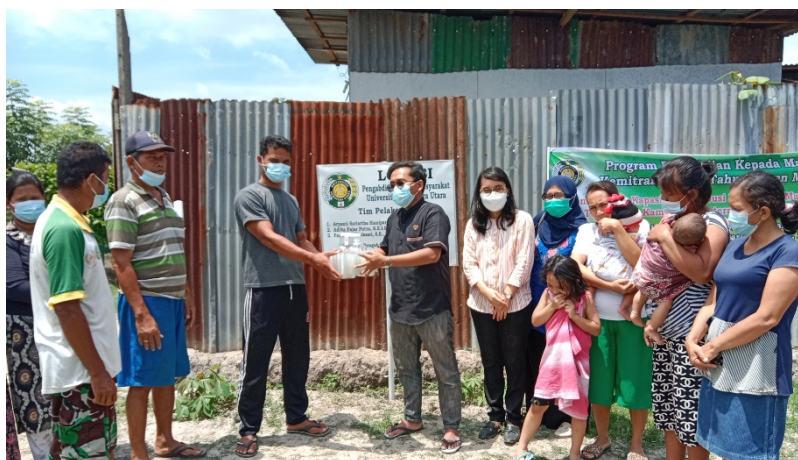
Figure 4. The participant received the tools provided

One of the problems experienced by the majority of MSMEs is the lack of understand the brand as a function to maintain the sustainability of its business. Most MSME business people are still focused on trading/sales and forget the brand side. This can be caused by not understanding the knowledge of marketing strategies and the benefits of attractive packaging and never received assistance. Therefore, for the second training material, the next speaker gave: marketing strategy materials through brands and packaging for SMEs especially for business partners. Materials about this brand will help business partners how to make a suitable brand for your business. Training on strategy This brand will guide partners in designing a suitable brand and product packaging for business partners. This brand building strategy training will create a brand for business partners to be able to compete in the form of products cake as a specialty from the field later.