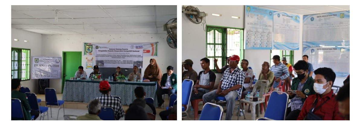
Figure 4. Socialization of activities to POKMASWAS Elang Putih mitra and the KUB Bina Usaha Mandiri fishing group

fishing group and related agencies who attended the socialization activities, namely the Village Head, Extension Officer of the Ministry of Marine Affairs and Fisheries and representatives of Bandar Khalifah Subdistrict, Serdang Bedagai Regency, conducted at the Office of the Village Head of Pekan Bandar Khalifah, Bandar Khalifah Subdistrict, Serdang Bedagai Regency, North Sumatra Province.