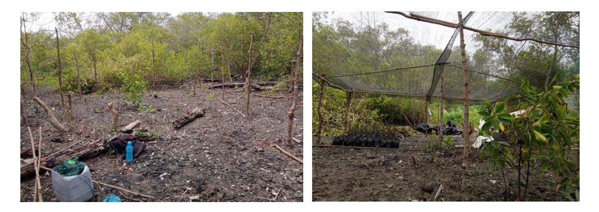
Figure 2. Construction of Bedeng

The community service team with mitra prepare activities by choosing nursery locations that are influenced by tides, providing bedeg with a size of 5x10 m with a height of 1.5 m. The bedeng are given light shade from paranet as the result of the construction of the bedeng, which can be seen in Figure 2.