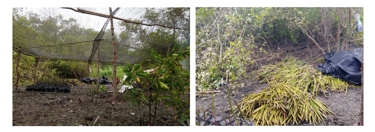
Figure 3. Mangrove Seeds

The prepared polybags by community service team, then the seeds were planted using soil sediment at the nursery location according to the characteristics of the seeds and filled <sup>3</sup>/<sub>4</sub> of polybags with a depth of 10cm then allowed to stand for 24 hours, then watering the mangrove seeds when the time receded, the media for the mangrove nursery can be seen on Figure 3.