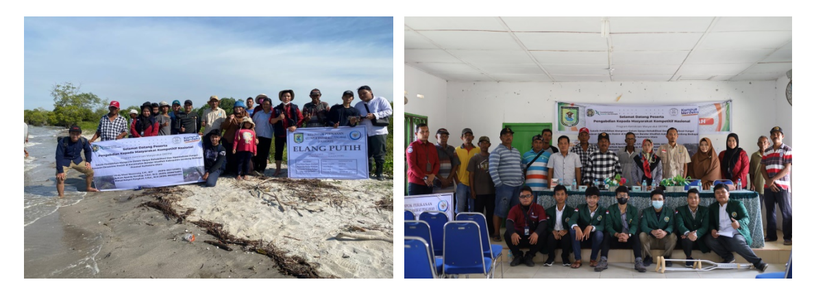
Figure 6. Closing of the mangrove nursery practice

The implementation of mangrove nurseries is carried out in locations that have environmental factors that support the optimal survival rate of mangroves, with the techniques used in mangrove nurseries in this activity have a high potential for survival [4]. so that it can restore the ecological and socio-economic functions of the people of the Bandar Khalifa sub-district, especially the fishing mitra of POKMASWAS Elang Putih and the KUB Bina Usaha Mandiri fishing group.