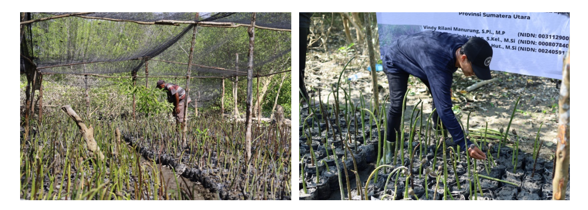
Figure 5. Mangrove nursery practice

Field practice was carried out by the University of North Sumatra community service team, Ministry of Marine Affairs and Fisheries extension, and POKMASWAS Elang Putih mitra and the KUB Bina Usaha Mandiri fishing group consisting of five people from each mitra group, which is then divided into two mitra groups, each mitra group is accompanied by a community service team to facilitate mangrove nurseries, field practice is located at coordinates 3°28'22.782"LU and 99 °17'50.752"BT, the distance to the location point is about 1 hour away by fishing boat, then walk to the nursery for about 10 minutes. The purpose of this field practice is to provide education to mitra fishermen on how to breed with optimal survival rates.