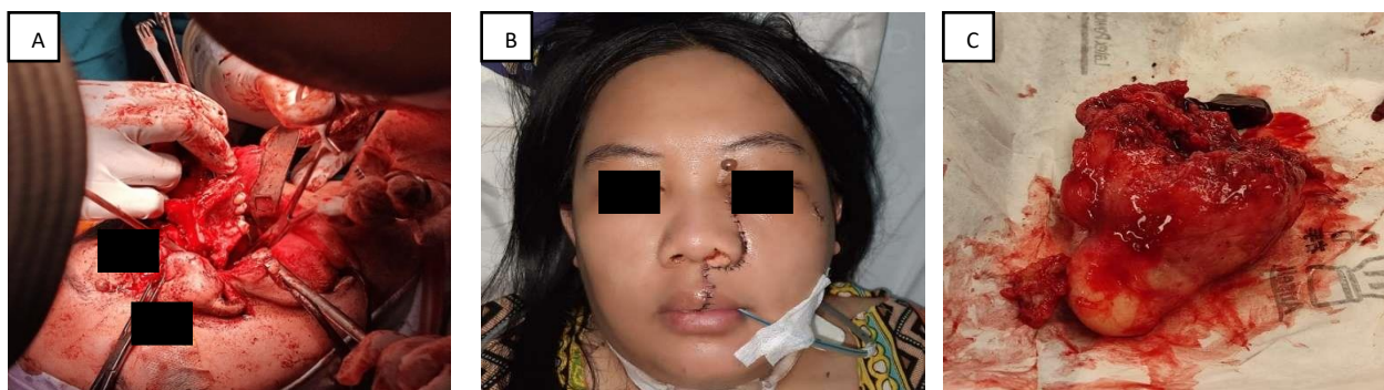
Figure 1. The maxillary swing technique with skin incisions along Weber–Fergusson (Figure 1a-c)

Traumatic ulcer in this patient occurred due to iatrogenic trauma after basal cell adenoma surgery, performed using the maxillary swing technique with skin incisions along Weber–Fergusson (Figure 1a-c). This surgical technique caused postoperative traumatic ulcer on the oral mucosa and upper lip [7,15].