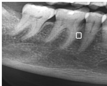
Figure 2. The box with size of 30x30 of premolar distal was made from the centre of ROI