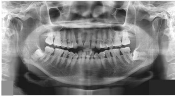
Figure 1. The picture of panoramic radiograph