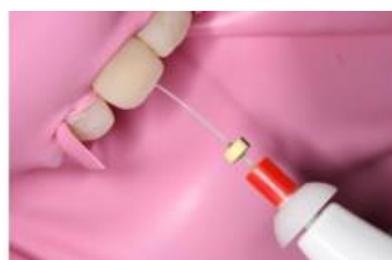
Figure 5. Irrigation activation