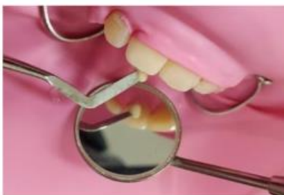
Figure 16. Composite application.