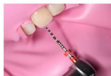
Figure 4. Biomechanical preparation

The biomechanical preparation of the root canal was performed with rotary NiTi files until X2 Protaper Next (Dentsply), using the crown-down pressure less technique (Figure 4). The canal was activated by a sonic activator (Endo Activator, Dentsply) with 5.25 percent sodium hypochlorite (NaOCl) irrigation between the instrumentations (Figure 5). Trial gutta point was performed, and radiographically confirmed (Figure 6; Figure 7). Finally, the root canal was irrigated using NaOCl 5,25%, EDTA 17%, and water saline. Then, using the paper point, the canal dried. Next, the canal was obtured using single cone technique and resin-based sealer. Obturation was confirmed radiographically and temporary fillings were placed (Figure 8).