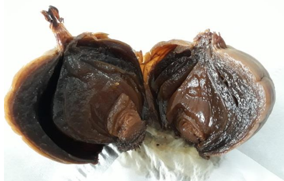
Figure 2. The appearance of fermented onion's bulb after halving.