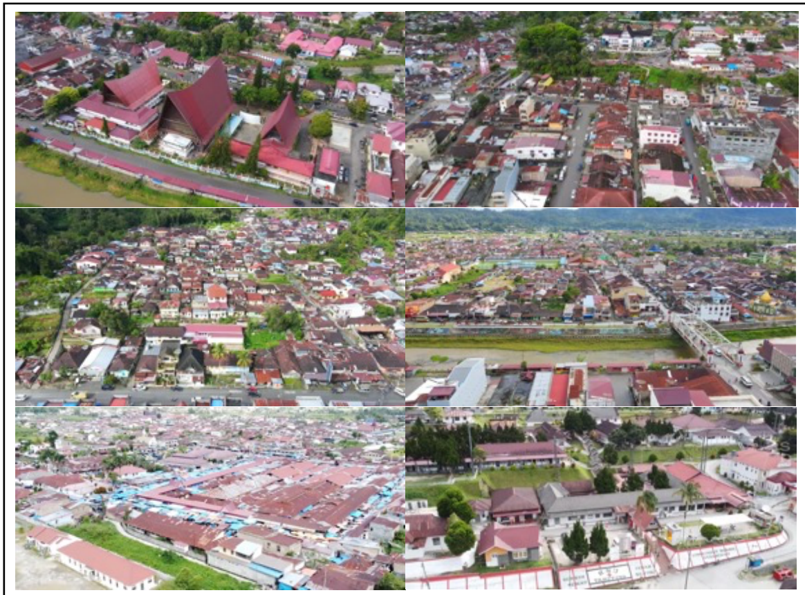
Figure 2 View of Tarutung City [11] [12] [13]

The buildings in Tarutung City are low-rise buildings, It can be seen on figure 2. Low-rise buildings are buildings with several floors around 1-3 floors, height < 10m based on Mulyono in 2000 [10].