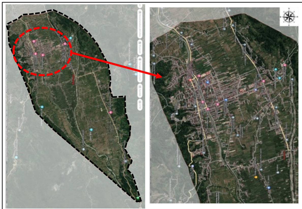
Figure 1 Maps of Tarutung City [5]

This research is located in Tarutung City, North Tapanuli. It can be seen on this map (Figure 1) that the city of Tarutung has a density along the Aek Sigeaon River, the Sumatran causeway, SM. Raja Street, Ferdinan Lumbantobing Street and Mayjend D.I. Panjaitan Street.