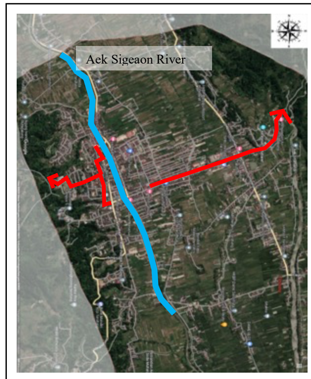
Figure 4 Rute Maps of Tarutung City Evacuation [5]