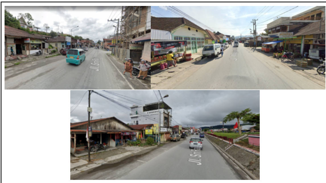
Figure 3 Street View of Tarutung City [14]

In Tarutung City, the pedestrian path is above the city drainage and has unfavorable conditions because the pedestrian path is used for parking, trading, and other functions, thus disrupting evacuation routes (Figure 3).