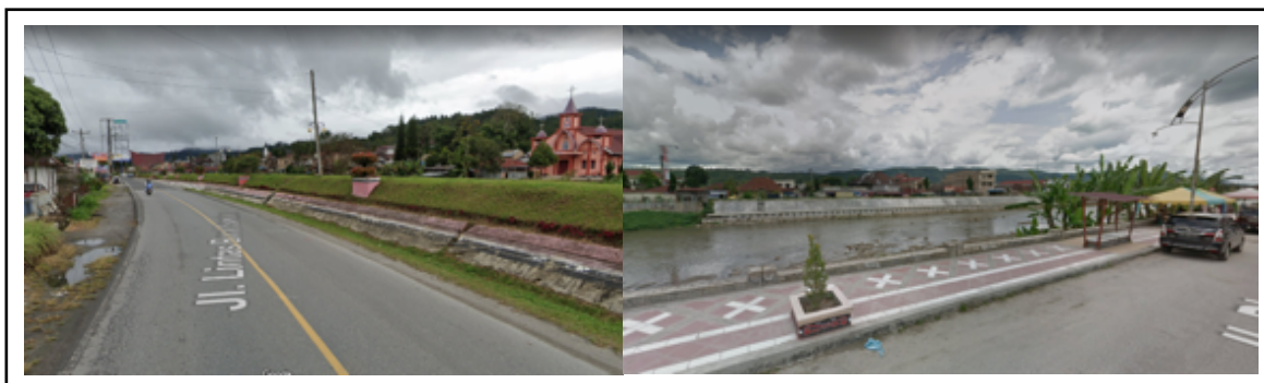
Figure 5 Levee of Aek Sigeaon River on Tarutung City [14]

Tarutung city is split in two by the Aek Sigeaon River. To anticipate an overflowing disaster due to floods or earthquakes, a retaining embankment is made along the Aek Sigeaon River (Figure 5).