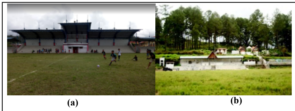
Figure 7 Tarutung Multipurpose Field Tarutung City (a) [15] and Tarutung Tangsi Ball Field Tarutung City (b) [15]