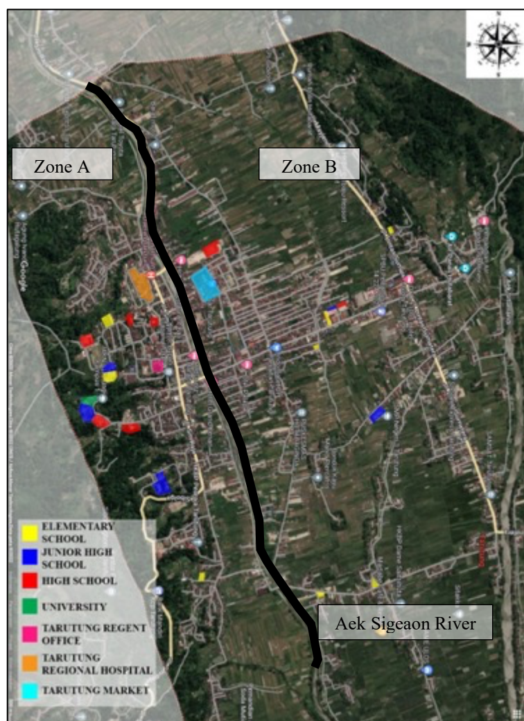
Figure 8 Tarutung City Public Facilities Map [5]

Most public facilities are located in zone A, this can be seen from the figure 8. The trade center for Tarutung City is Tarutung Market which is in zone B. The government center for Tarutung City is the Office of the North Tapanuli Regent in zone A. And the health center for Tarutung City is the Tarutung Regional General Hospital in zone A.