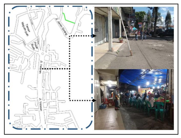
Figure 3 Pedestrian pathway functions during the day and night

The presence of night tours will bring the city night time to life. These activities will not only turn on the night environment but can also increase the value and function of the surrounding land. Until now, the area provided for night tourism activities in the City of Berastagi is only along Veteran Street. The pedestrian path in this area functions as a culinary tourism destination that will only open starting at 18:00 WIB, which known as Pasar Kaget. Allotment of the downtown area that functions as a tourist at night can also be an effort in improving land functions, where land use does not only focus on daytime activities but continues into the evening [10]. This theory is related to what happened on Berastagi, and Veteran Street is the main route and centers of Berastagi. The pedestrian path that only functions as a means of pedestrians in accessing a place is functioned as a tourist destination at night (Figure 3). The presence of the Pasar Kaget also added to the value of the building behind it. Every stall that is opened in the Pasar Kaget area has been registered and had legality for temporary use. Traders are given an area of 3x4 meters for each stan with the note they must leave enough space for pedestrians. The business license also states that traders must be ready if the Pasar Kaget area will move to another place.