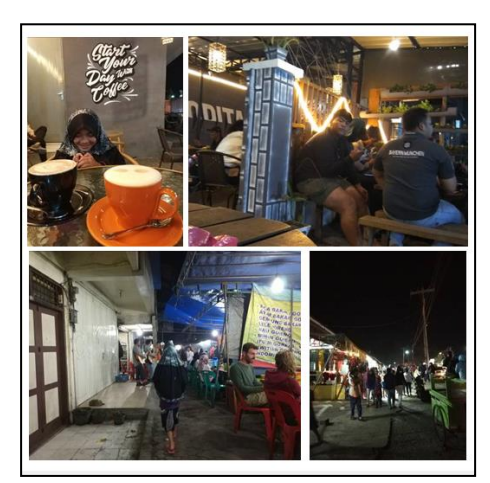
Figure 6 Berastagi Night Tourism Attractions

the cafes in the City of Berastagi (Figure 6). Meanwhile, to look for souvenirs, tourists can visit the Fruit Market, but not all shops in the area are open until night.