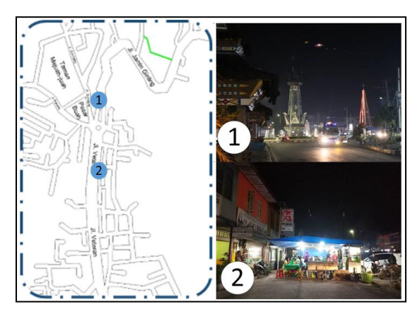
Figure 5 Forming the Image of Berastagi Night Tourism Area

gives a lonely impression for tourists. By applying local culture in its planning, tourism activities will blend with the beauty found in the surrounding environment. The implementation of the local culture can provide an environment characteristic that becomes the image of the night tourism area [18]. Currently, there is no visible image in the development of the Berastagi city night tour. The only thing attached to tourists about the Berastagi night tourism is Pasar Kaget (Figure 5). There is no specific design or nuance application that shows the richness of Karo culture owned by the City of Berastagi in this region.