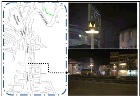
Figure 4 Design lighting that applies elements of Karonesse culture

Night conditions need the right lighting to provide comfort and safety for tourists. The local government also realized lighting planning needed on developing the night tourism. Lighting at night not only serves as a sense of security, but light can be part of the aesthetic. The darkness of the night presented with the lighting designed can change the image of the night and give aesthetic value to the city environment. The processing of local culture in the planning of night tourism lighting will provide a characteristic inherent in the image of the city. Used the local cultural aesthetics as forming elements of the design of night tourism lighting will give beauty to the region [7]. Involving local aesthetic values in night lighting planning has also been planned to be implemented in Berastagi. At this time, there is already city lighting that applies cultural elements in the form of traditional Karonesse house (Figure 4). The ethnical design will give a distinctive impression for tourists who see it, so that street lighting has not only practical value but also an aesthetic value for the city.