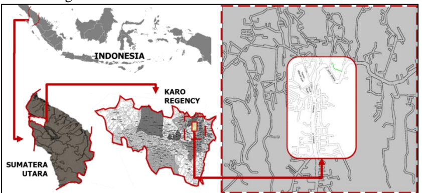
Figure 1 Research Area

The study aims to find the environment and night atmosphere aspect in Berastagi night tourism, which develops with the local wisdom approach. For creating a precise and contextual result analysis, this paper used a descriptive qualitative method [16]. The primary data was collected by depth interview and field observation in the research area (Figure 1). Eight people who become the key respondent for depth interview was categorizing with based on the previous similar study [3]. The characteristic of the key respondent is academics, arts workers, community leaders, government, and tourism experts who know well about night tourism and local wisdom in Berastagi.