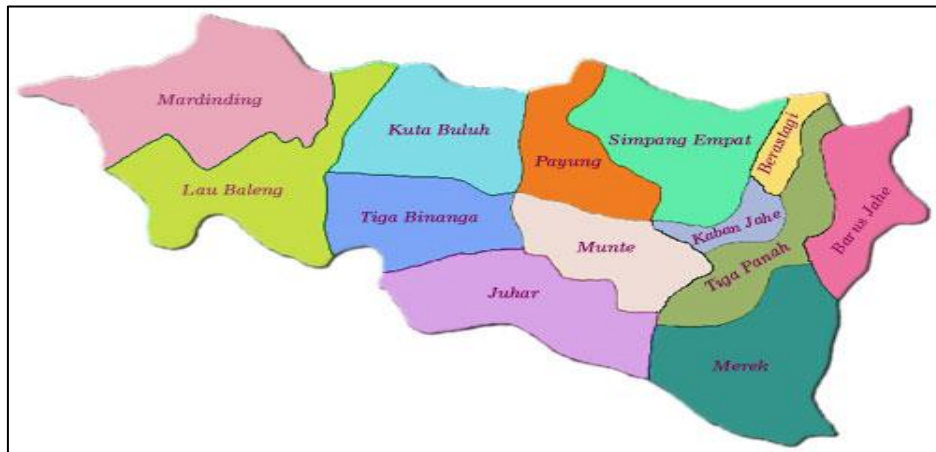
Figure 1 Research Area

Karo district has an area of 2.127,25 Km 2 consisting of 17 sub-district [5]. Most of the land is dry land (field and garden), rice field, forest, grassland, unplanted swamp and much more [6]. Much of the land is a green tourist spot that is cool and beautiful, that is the mainstay of this district. As for the sub-districts in the Karo district, can be seen in the Figure 1.