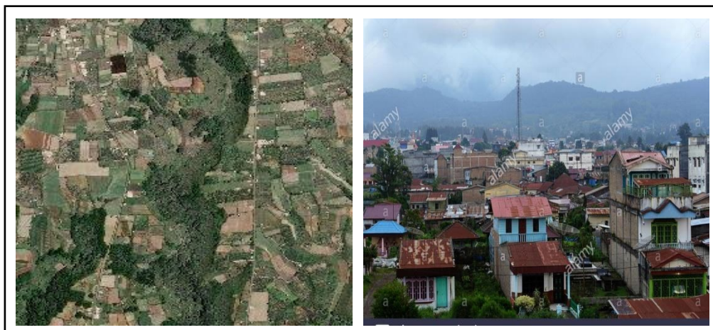
Figure 4 Research Area

The space division concept is based on transcendental values, which are a division of spaces with very basic percentages related to people's belief. This space with transcendental exists in the religious system, system knowledge, system technology and living equipment, relationship genetic system, language, livelihood system, and arts [8]. From the Figure 4, it can be seen how dense the residential population on Berastagi sub-district.