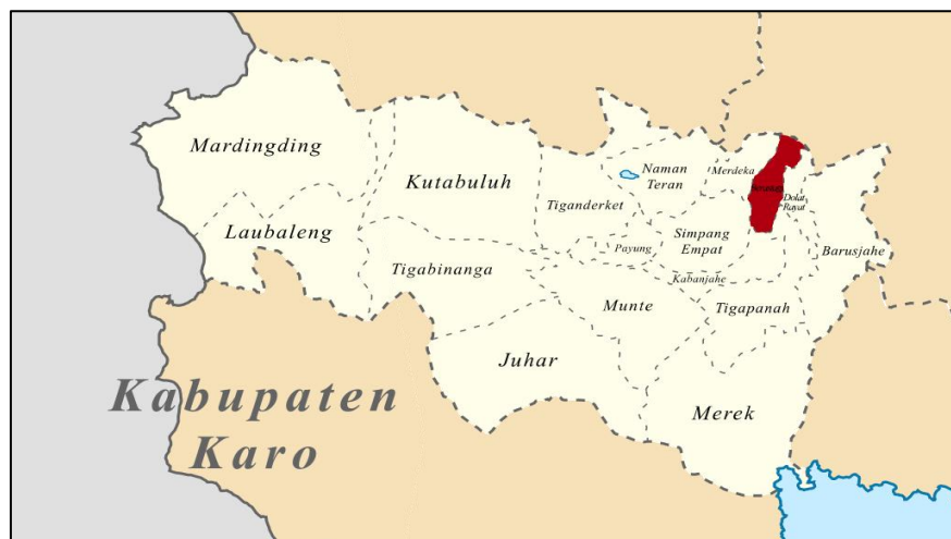
Figure 2 Research Area

One of the most familiar regions in the Karo district is the Berastagi sub-district. Although the Berastagi sub-district is the smallest sub-district in the Karo district, still it has many lands which is used as tourist spot interest often visited the local community and the domestic community [7]. That matter makes Berastagi sub-district have population density level, and residential areas are higher than other sub-districts in Karo district (Figure 2).