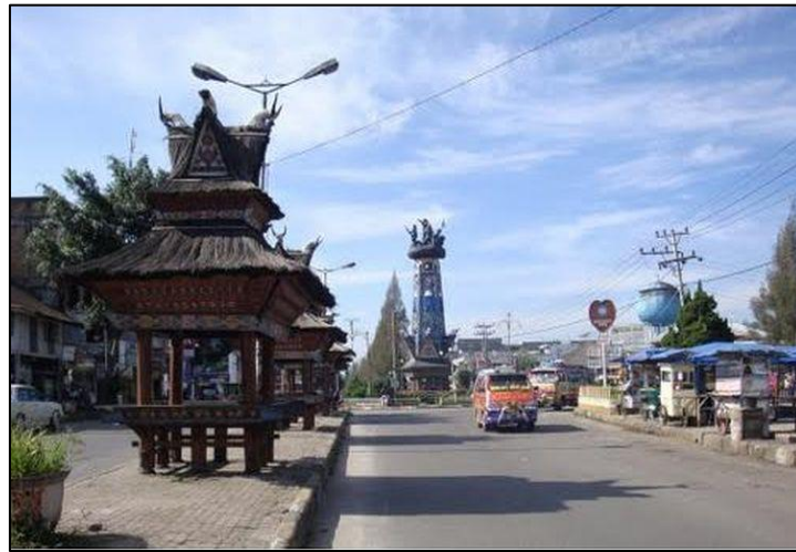
Figure 5 Research Area

Settlement development virtually heads to realizing settlement conditions urban and rural areas healthy and very liveable, safe, comfortable, peaceful, and sustainable so that it is created enhancement public welfare. On the other side, there is a residential environment has been growing relatively very fast with a high total population, so that tends to result in residential environment get rundown (slum area) because of limited availability of necessary infrastructure and facilities [11]. The high housing necessary and habitation in the city make more impact growing of new slum area [12]. This matter describes that need for land and space for shelter business activities are very increasing when the availability of land and rooms in the city increasingly limited, on the other side high tendency of society who wants to live close to the downtown, so that can make it easy to find a job. When the hinterland, many have vacant land and not much many residential areas. When viewed from the plateau can see intensiveness housing in the city area. Whilst the verge area only have landed like gardens, swamps, and rice fields (Figure 6).