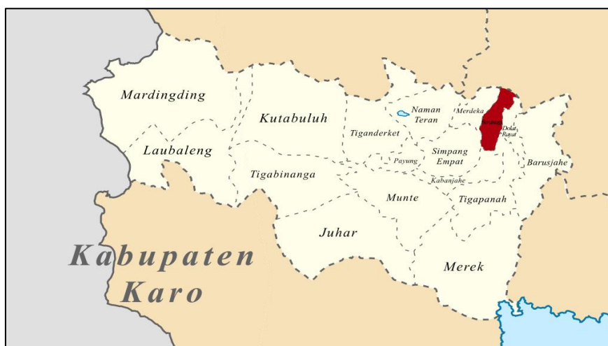
Figure 2 Research Area

One of the most familiar regions in the Karo district is the Berastagi sub-district. Although the Berastagi sub-district is the smallest sub-district in the Karo district, still it has many lands which is used as tourist spot interest often visited the local community and the domestic community [7]. That matter makes Berastagi sub-district have population density level, and residential areas are higher than other sub-districts in Karo district (Figure 2).