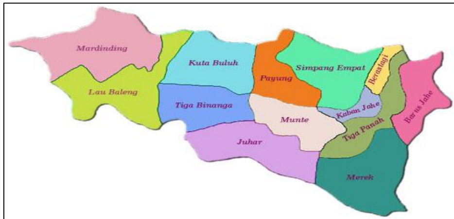
Figure 1 Research Area

Karo district has an area of 2.127,25 Km 2 consisting of 17 sub-district [5]. Most of the land is dry land (field and garden), rice field, forest, grassland, unplanted swamp and much more [6]. Much of the land is a green tourist spot that is cool and beautiful, that is the mainstay of this district. As for the sub-districts in the Karo district, can be seen in the Figure 1.