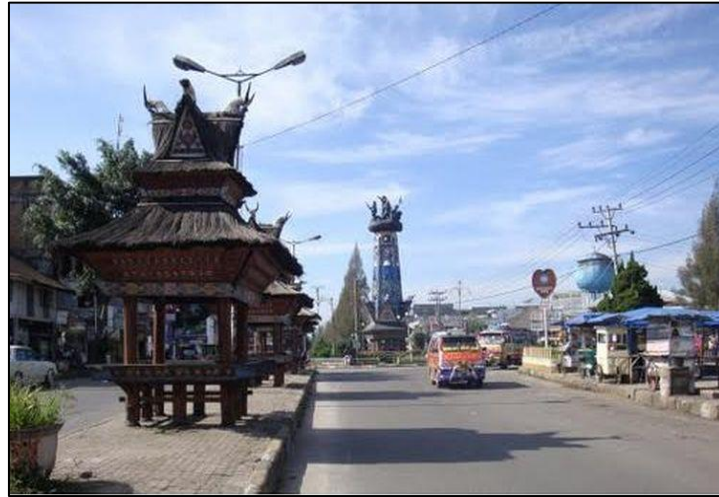
Figure 5 Research Area

Settlement development virtually heads to realizing settlement conditions urban and rural areas healthy and very liveable, safe, comfortable, peaceful, and sustainable so that it is created enhancement public welfare. On the other side, there is a residential environment has been growing relatively very fast with a high total population, so that tends to result in residential environment get rundown (slum area) because of limited availability of necessary infrastructure and facilities [11]. The high housing necessary and habitation in the city make more impact growing of new slum area [12]. This matter describes that need for land and space for shelter business activities are very increasing when the availability of land and rooms in the city increasingly limited, on the other side high tendency of society who wants to live close to the downtown, so that can make it easy to find a job. When the hinterland, many have vacant land and not much many residential areas. When viewed from the plateau can see intensiveness housing in the city area. Whilst the verge area only have landed like gardens, swamps, and rice fields (Figure 6).