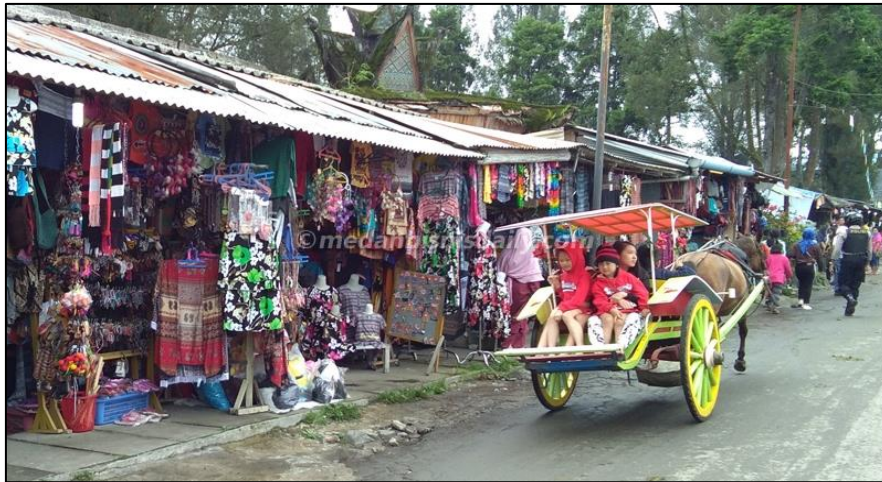
Figure 3 Research Area

and many others. Some are working in area travel as a guide or employee in Berastagi sub-district (Figure 3).