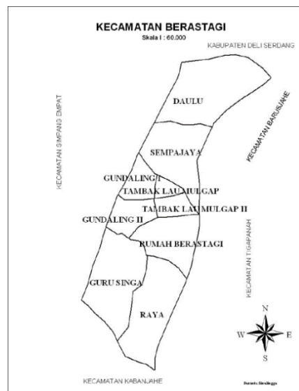
Figure 7 Research Area

The study aims to find the environment knowing and the atmosphere is there in Berastagi sub-district that was developed with approach local culture. Although Berastagi sub-district only has an area of 30,5Km 2 and including the smallest area which consists of six villages and four villages district [13]. But being one of the site areas played a big role in improving the economy in Karo district. This is because so many tourists visiting this area. In the following figure, you can see level several villages/ villages sub-districts in the Berastagi sub-district (Figure 7).