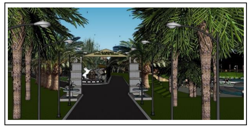
Figure 4 The main gate and sign board in the form of a horse statue

The provision of pedestrians is indispensable in a tourist area; its function is to direct visitors within the tourist area and can also give a neat and orderly impression to the tourist area. Providing resort facilities such as huts, cafes, and park benches needed in a tourist area can be used as a concept to accommodate visitors by creating a more comfortable social area such as a cafe near the parking area, a cottage inside the Bali resort, a cafe in the waterpark area and the pavilion in the palm tree agro education area (Figure 5).