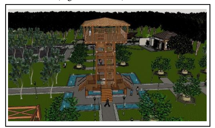
Figure 12 Bali resort area

The landmark in the Little Bali in the Medan T-Garden area can be a gate because the gate is a marker gate. As the tallest and most easily seen object, the tower of view can also be a landmark. Based on the crowd and the things that are most remembered by visitors, the Bali resort is suitable to be a landmark (Figure 12 and 13).