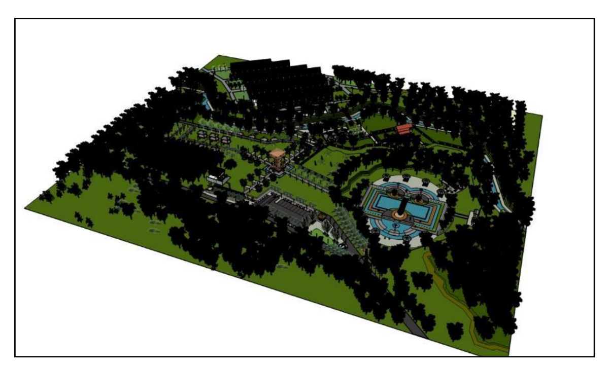
Figure 14 Perspective of tourist areas