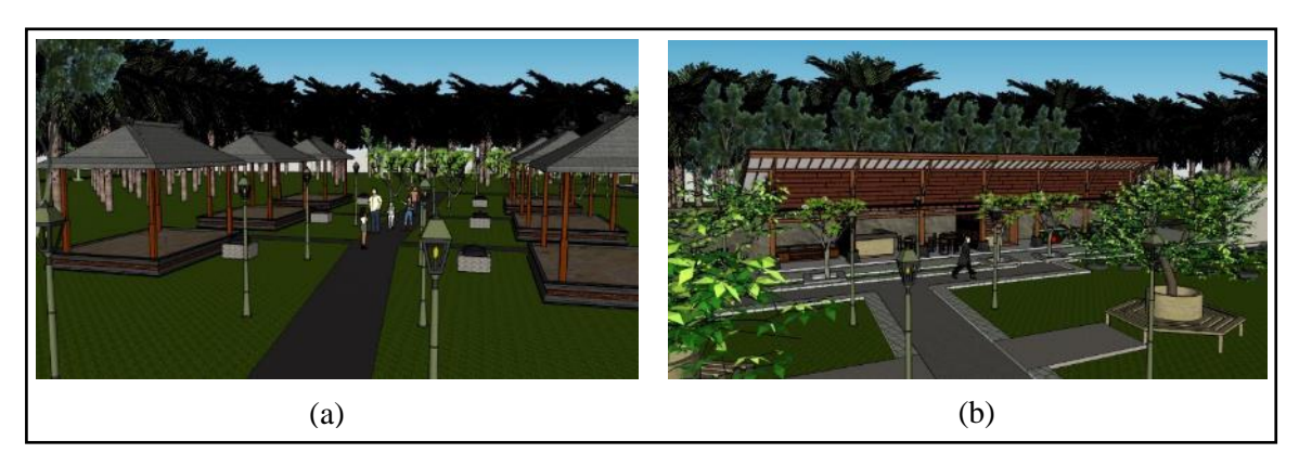
Figure 1 (a) A place for processing palm sugar and fro, (b) A typical snack bar from the palm tree

River Valley Residence is located in the east of the tourist area. This housing can use as a source of the permanent market in this tourist area by offering a regular payment system every month. This gives visitors freedom from the River Valley Residence housing to relax in this tourist area (Figure 2).