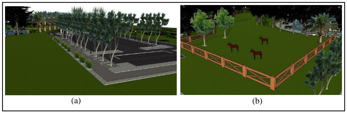
Figure 11 (a) Edge design plan in the parking lot, (b) Edge design plan in the ranch area

Edges that distinguish between tourist areas are trees and pedestrians. Revitalization is carried out in processing the boundary form to provide a better and stretcher image of the corridor, such as on the edges of the parking lot and horse riding area (Figure 11).