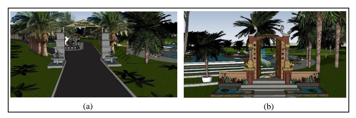
Figure 13 (a) Main gate design plan, (b) Archway design plan in each tourist area