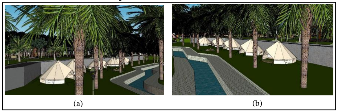
Figure 8 (a) Riverside camp area design plan, (b) River area

The potential of rivers can be developed by creating a riverside camp, a camping program with a panoramic sensation of rivers and forests combined with outdoor activities such as camping, bonfires, and river adventures (Figure 8).