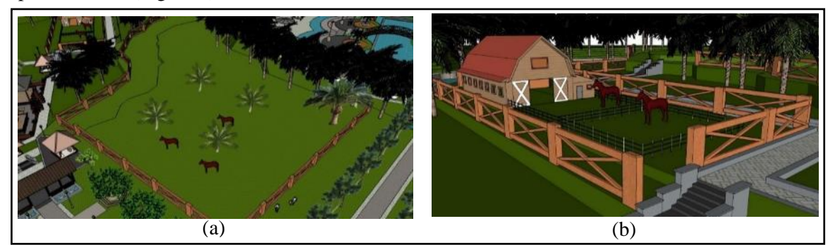
Figure 6 (a) Ranch area design plan, (b) Horse care area design plan

Little Bali's T-Garden area in Medan has several tourist area points that are considered potential in tourism development, namely the agro-palm resource processing tourism, Bali-style resort tourism, ranch tourism, river adventure and camping land tourism and provide education in caring for horses and tourism water park. Horse farm that provides horse training services and follows horse care processes such as cleaning and feeding horses. this activity will be guided by professionals (Figure 6).