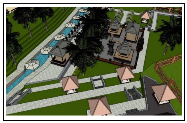
Figure 10 Bali resort area

The resort area is the most crowded; its strategic location is crossed by a river so that it gives a beach-like atmosphere to visitors and also provides huts, as well as Balinese buildings which are attractive spots in this tourist area (Figure 10).