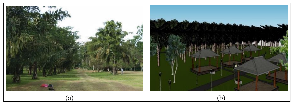
Figure 7 (a) Palm plantation area, (b) Agro tourism area design plan on the palm plantation

This area tends to be quiet due to the absence of any activities there so that the concept of tourism is made by utilizing existing natural resources namely, agro-tourism education in processing palm sugar and fro (Figure 7).