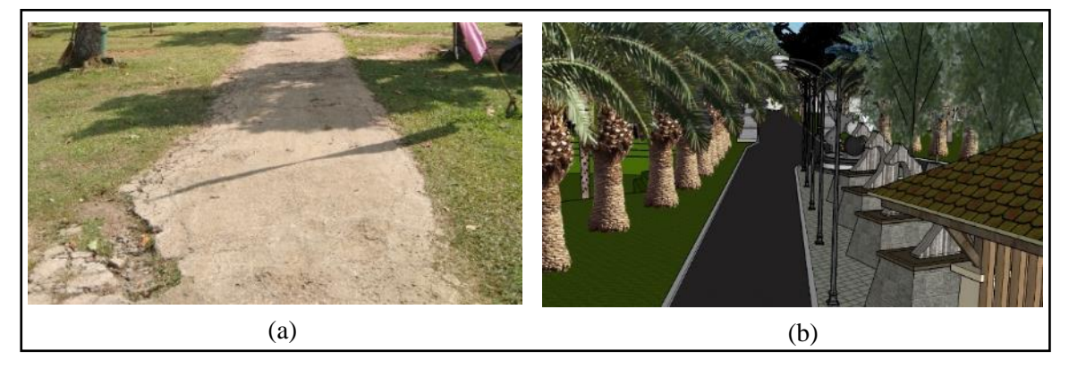
Figure 3 (a) Vehicle lane before revitalization, (b) Vehicle lane after revitalization

There are several gathering points in the tourist area of the T-Garden Little Bali in Medan, namely horse riding fields, sugar palm plantations, Bali resorts, and waterpark, but the activity with the highest daily usage is centered on the Bali resort so it needs to be revitalized in other tourist areas to attract visitors and so This tourist area is becoming more lively. The physical condition of some of the facilities available in the T-Garden tourist area of Little Bali in Medan such as vehicle lanes that have not been designed and are still in the form of potholes so that the structure needs to be improved and provide road directions (Figure 3 and 4).