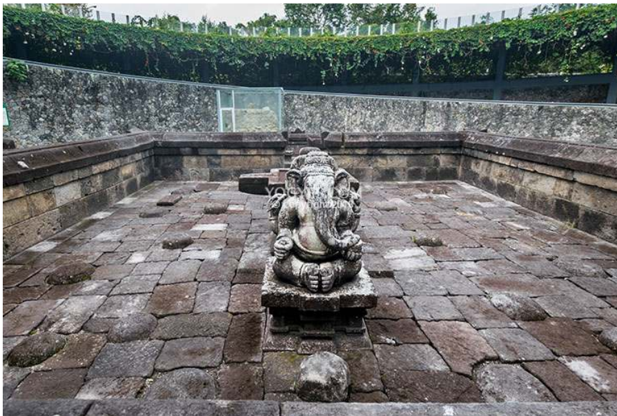
Figure 5. Arca Ganesha