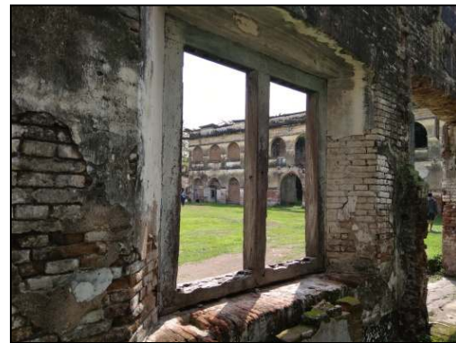
Figure 5. The fort frame uses teak wood