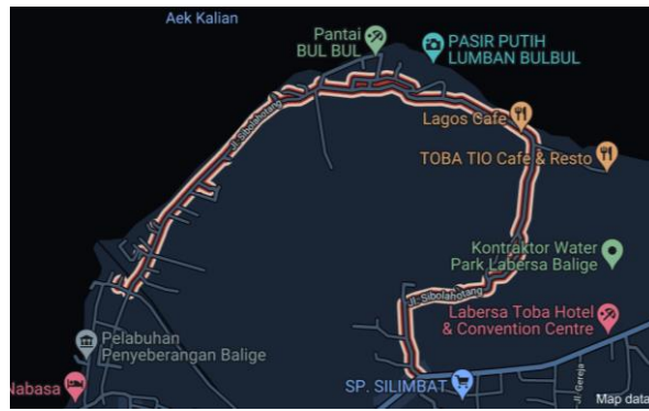
Figure 1. Sibolaho Street