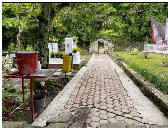
Figure 3. Application of Information