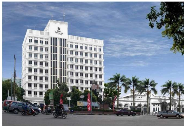
Figure 4. Hotel De Boer (now Inna Hotel ) in Medan Merdeka Square

Another point of interest is the monument of Medan zero kilometer in front of heritage buildings Kantor Pos Medan. With the background of the legendary Hotel De Boer (Figure 4) then this area becomes crowded node where even now has become a community gathering points of bicycles and pedestrians. Rating if the desire to stay at the heritage hotel Hotel De Boer is the right choice. A little to the left will be neatly lined colonial buildings that Bank Indonesia building and the Balai Kota has been conserved adaptive re-use becomes Aston Hotel .