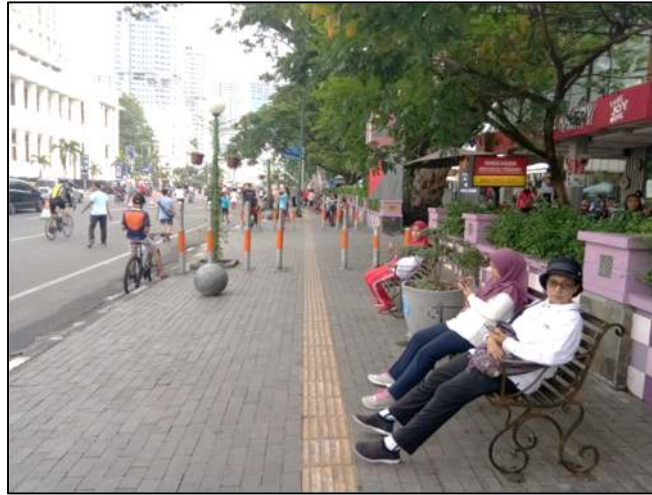
Figure 7. Potential Gateway District facilities in Medan Merdeka Square

Merdeka Square neighborhood linkage will be formed with the ease of access to important nodal of railway station, Lonsum building, Bank Mandiri building, Balai Kota , Hotel De Boer (now Inna Medan ), Kantor Pos building, Kesawan heritage district and Pajak Ikan Lama trade center. Movement of tourists visit can be done with local transport model uses a motor rickshaw decorated with typical of the city of Medan. The movement of productive economic activities in the area of Merdeka Square is consistent with the concept that combines street and square along with interesting activities in the locality strengthen local identity.