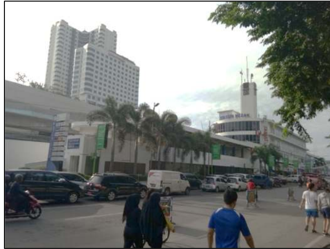
Figure 5. Potential Gateway District around railways station in Medan Merdeka Square