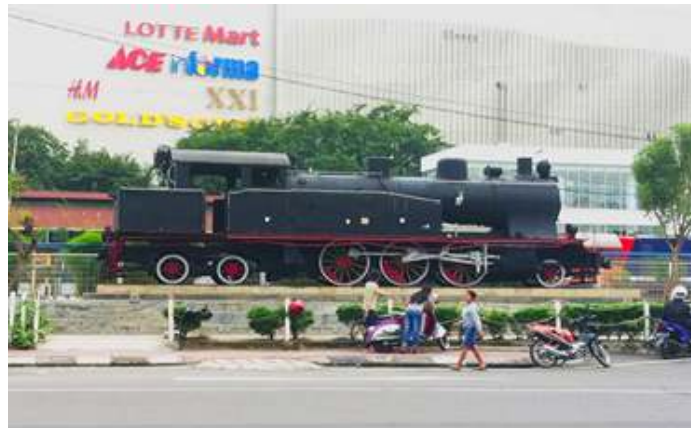
Figure 3. Dutch era Locomotive Monument in Medan Merdeka Square

Another point of interest is the monument of Medan zero kilometer in front of heritage buildings Kantor Pos Medan. With the background of the legendary Hotel De Boer (Figure 4) then this area becomes crowded node where even now has become a community gathering points of bicycles and pedestrians. Rating if the desire to stay at the heritage hotel Hotel De Boer is the right choice. A little to the left will be neatly lined colonial buildings that Bank Indonesia building and the Balai Kota has been conserved adaptive re-use becomes Aston Hotel .