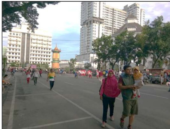
Figure 6. Potential Gateway District activities in Medan Merdeka Square (Source: Author observation, 2019)

Provision of facilities for public street furniture such as seats (Figure 7) and decorative lighting city room accommodates enjoyment activities with visual treat towards the historical buildings, under the shade of a big tamarind tree, street musicians show with thematic exhibitions and special snacks treats the city of Medan. This city open space can be used also for the activities of the souvenir center that will strengthen memories the city of Medan.