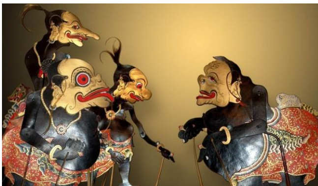
Figure 3. Punakawan in Wayang.

Third, the character Gandari, if in the Indian story, still loves and gives love to the Pandavas, even though they are not her own children, but in the Javanese version the characterization is very much different. In the Javanese version Gandari is depicted and told to hate the Pandavas, and Gandari raised them with hatred. Fourth, the Punakawan character is a character that cannot be found in Indian stories. The Punakawan figures are innovations from Indonesia, which consist of Semar, Gareng, Petruk, and Bagong who are tasked with nurturing the Pandavas so that they will grow up well and be ready to face battles, while one of the other Punakawan is named Togog, he is tasked with nurturing the Kurawa. Fifth, the Gatotkaca and Tiwikrama characters are described as superhuman in the Javanese version of the story. Gatotkaca is said to be able to fly and has wire muscles and iron bones, while Tiwikrama is described as having extraordinary vision and hearing.