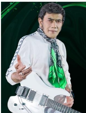
Figure 5. Rhoma Irama

I use ornaments [cengkok] I learned from listening to Indian music records. I like Indian songs because they are different. They are very moving and seductive. They capture the sound of people in love. (Ellya Khadam, personal communication/ Weintraub A, July 18, 2005). (Weintraub, 2010).