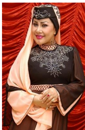
Figure 6. Elvy Sukaesih