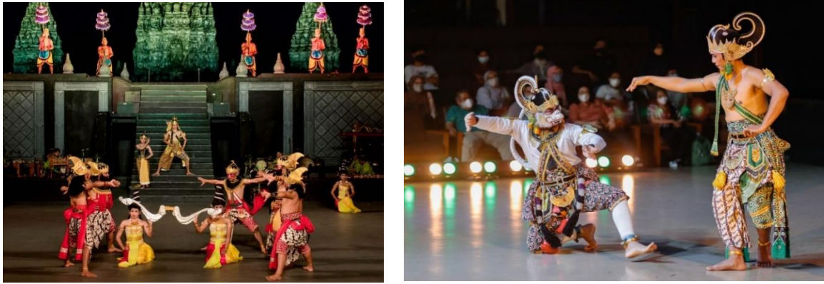
Figure 2. Ramayana ballet at Prambanan Temple: the development of the modern version of wayang wong

Mahabharata appearing (Fawaid et al., 2022)