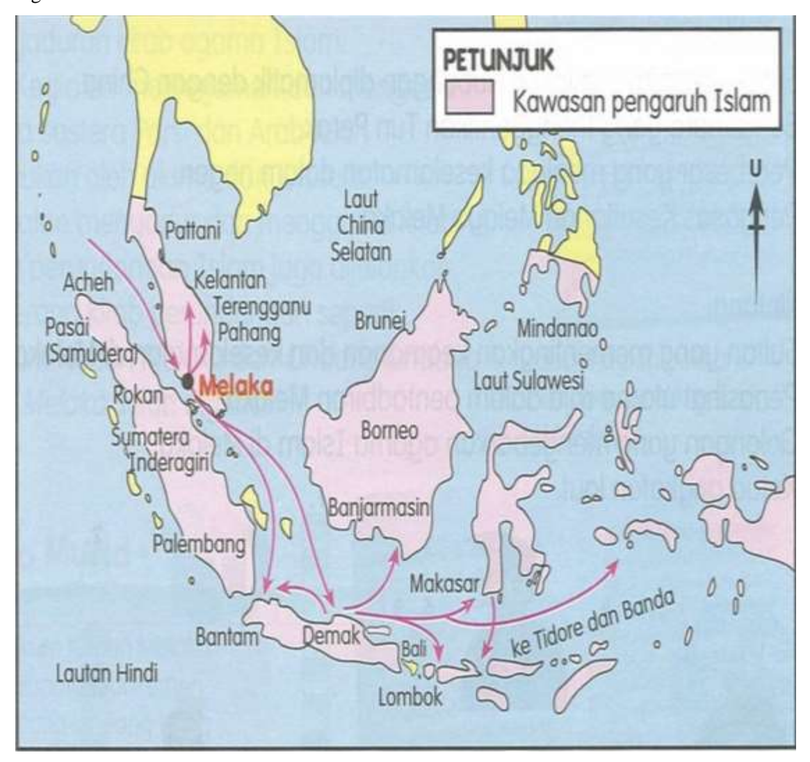
Figure 1. The spread of Islamic Teaching in South East Asia

To make it more understandable this map below provides pictures the spread of Islam in the region.