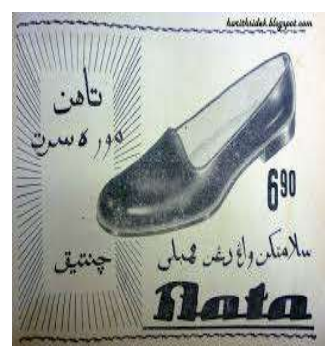
Figure 4. Shoe Company Bata uses Arabic scripture for advertisement

At that time, the ads were delivered in Arabic script because this script certainly had good commercial value.