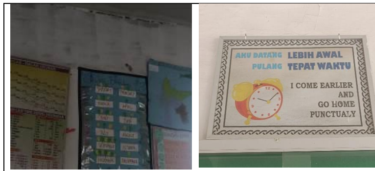
Figure 9. Schoolscape is bilingual in Indonesian and English

There are also bilingual forms in both the Indonesian and English languages.