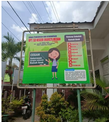
Figure 12. Linguistic landscape in its use as a prohibition

The sentence " Cegah kekerasan dengan sekolah ramah anak (Prevent violence with child-friendly schools)" in Figure 12 is an appeal or message to prevent violence in the school environment by promoting a child-friendly school approach.