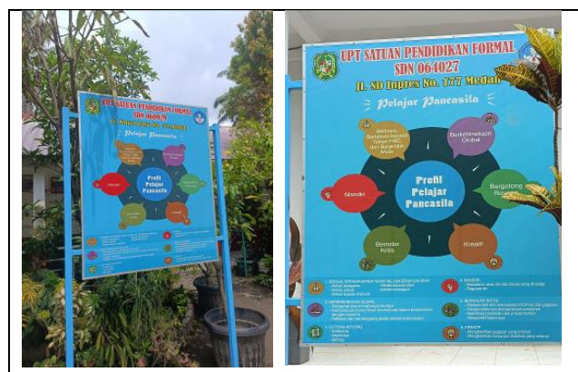
Figure 4. Use of word forms and phrases

Furthermore, micro-linguistic forms in the schoolscape of SDN in Medan are presented as words and phrases. Words describe specific contexts, such as explanations of extracurricular activities presented in the word " Pramuka " (Scouts). Some words describe commendable student characteristics, such as "honesty," "tolerance," and "independence." Phrases are a linguistic form commonly found in the linguistic landscape of elementary schools in Medan City. There are nominal phrases, verbal phrases, and adjectival phrases. For example, as shown in the figure below.