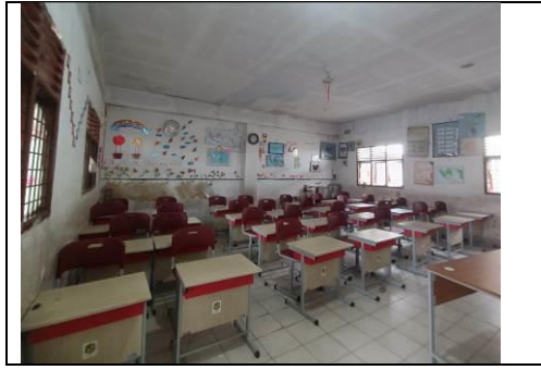
Figure 10. Linguistic Landscape in Mading and Classrooms

In contrast, the spatial design of school name boards placed in front of the gate or at the entrance of schools is primarily uniform and monotonous in terms of font type and color.