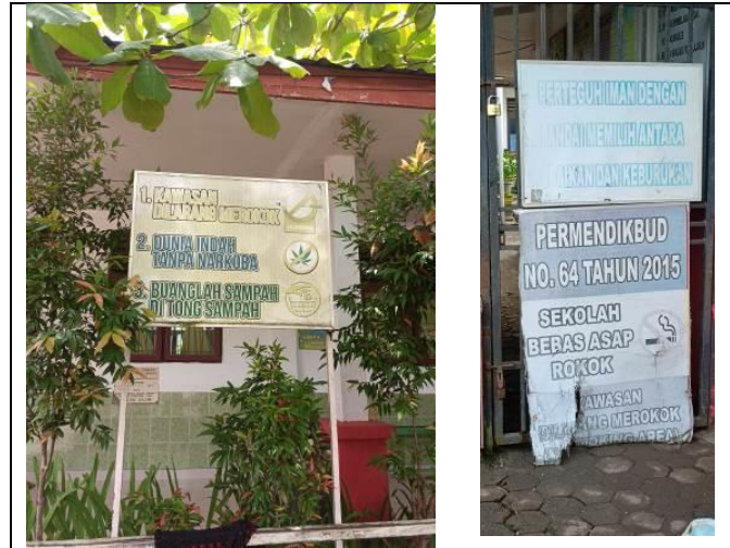
Figure 14. Linguistic landscape in its use as a prohibition

In Figure 14 above, the phrase " Kawasan dilarang merokok " uses a linguistic form indicating a prohibition or restriction on smoking in that area.