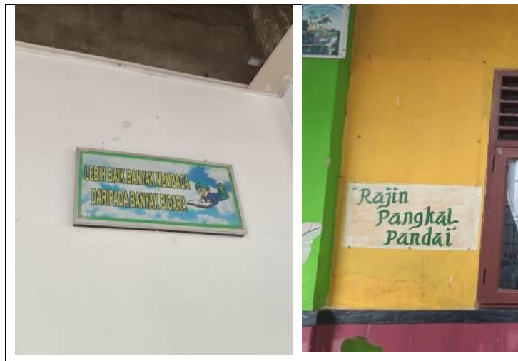
Figure 15. Linguistic landscape in the use of proverbs and slogans

Furthermore, the use of linguistic forms such as slogans and proverbs is also present. For example, the slogan " Lebih banyak membaca dari pada banyak bicara " (Read more, speak less) and the proverb " Rajin pangkal pandai " (Diligence is the key to success).