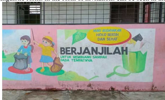
Figure 13. Linguistic landscape in its use as an invitation

Furthermore, the use of linguistic forms in the form of invitations can be seen in the following figure.