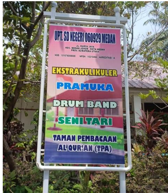
Figure 5. Noun phrase form

Some of the noun phrases in Figure 5 are as follows.