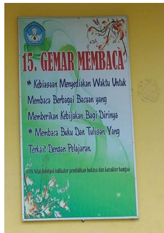
Figure 6. Noun phrase form

In Figure 5 there is a verbal phrase, " gemar membaca ."