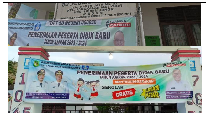
Figure 11. Linguistic landscape in its use as information

The use of linguistic forms in the schoolscape of public elementary schools in the city of Medan is presented through information, directives, invitations, prohibitions, slogans, and proverbs. For example, in the figure below: