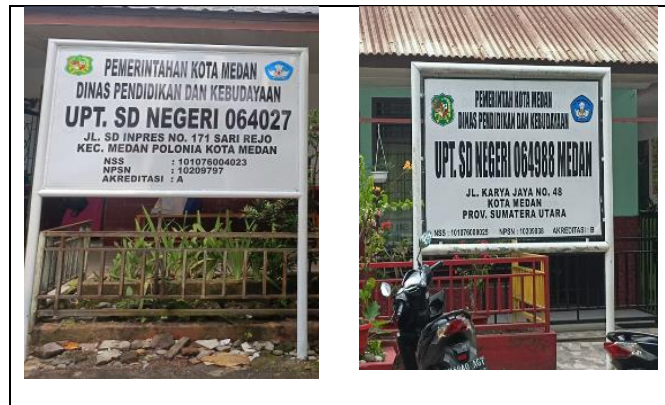
Figure 2. The form of the acronym in the public elementary schools in Medan

The micro-linguistic forms found in public elementary schools in Medan exhibit consistency in using acronyms on school name boards. These acronyms include UPT, SD, JL, NPSN, and NSS. There are also acronyms with multiple syllables (Anwariyah, 2023; Khoirunnisa et al., 2023; Mufrida & Zultiyanti, 2023), such as Pemprov (Provincial Government) and Kec (Sub-District).