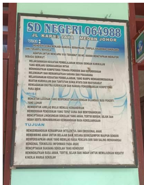
Figure 7. Sentence Form

Furthermore, the linguistic form of sentences can also be observed from the linguistic landscape of schools. Sentence structures are commonly used in informational boards, announcements, prohibitions, and instructions.