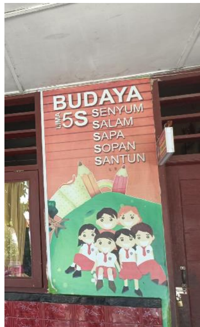
Figure 3. Form of the acronym "5S"

"5S" is an example of an acronym formed using the initials or initial letters of the words it represents. This type of acronym is commonly called an initialism or acronym initial. In this case, each initial letter of the words is combined to form the acronym "5S".