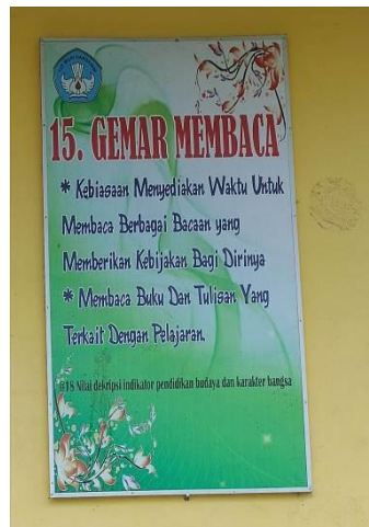
Figure 6. Noun phrase form

In Figure 5 there is a verbal phrase, " gemar membaca ."