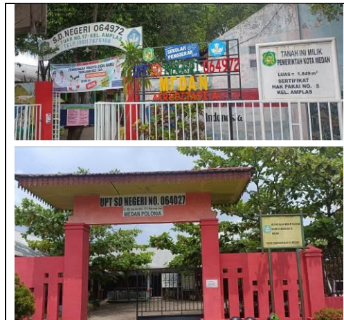
Figure 8. Schoolscape is monolingual in Indonesian

The linguistic landscape in Schoolscape in Public Elementary School Medan is presented with a dominant of monolingual forms in the Indonesian language, as depicted in Figure 8.