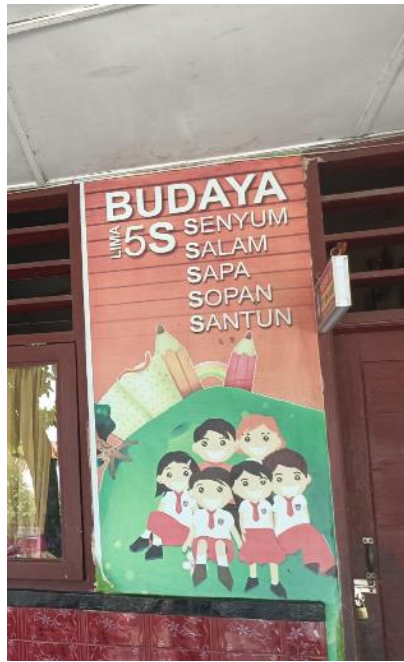
Figure 3. Form of the acronym "5S"

"5S" is an example of an acronym formed using the initials or initial letters of the words it represents. This type of acronym is commonly called an initialism or acronym initial. In this case, each initial letter of the words is combined to form the acronym "5S".