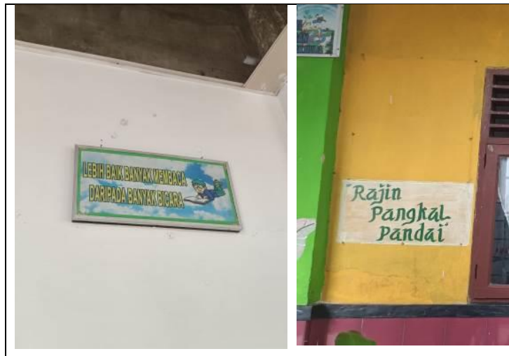
Figure 15. Linguistic landscape in the use of proverbs and slogans

Furthermore, the use of linguistic forms such as slogans and proverbs is also present. For example, the slogan " Lebih banyak membaca dari pada banyak bicara " (Read more, speak less) and the proverb " Rajin pangkal pandai " (Diligence is the key to success).