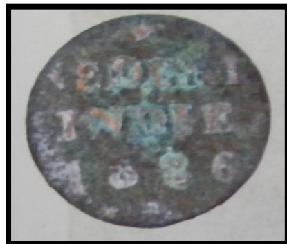
Figure 9. Nederland Indie coins

Figure 8 shows coin with Arabic script showing Islamic Year 1219 Hijriah = 1804 AD.