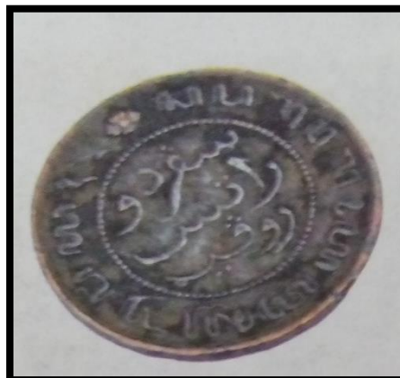
Figure 5. Netherlands East Indies Coins (The Back Side)

This coin was made from silver and the value about 1/20 Gulden, and was produced by Koninklijke Leidong Munt, Utrecht, Netherland. The front side showed an inscription–NEDERLANDSCH INDIES, and between the throne pictures of the year 1887, in the below side it is found a word ‘CENT’. In the back side of the coins were script with two alphabets, Javanese alphabet and Arabic Alphabet. The writing in Javanese was sapnyaba rayutus rupiyah and the writing in Arabische was sakdu ratus rupiyah which both mean seratus rupiah .