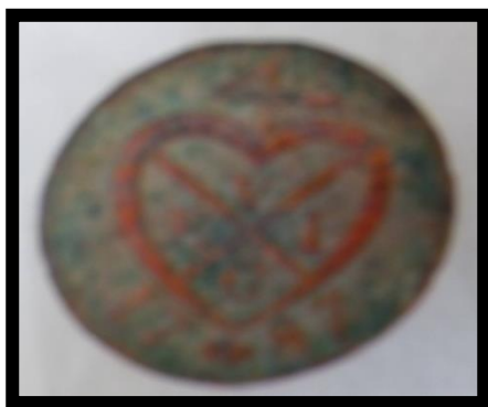
Figure 6. EIC Coin

This coin was made from silver and the value about 1/20 Gulden, and was produced by Koninklijke Leidong Munt, Utrecht, Netherland. The front side showed an inscription–NEDERLANDSCH INDIES, and between the throne pictures of the year 1887, in the below side it is found a word ‘CENT’. In the back side of the coins were script with two alphabets, Javanese alphabet and Arabic Alphabet. The writing in Javanese was sapnyaba rayutus rupiyah and the writing in Arabische was sakdu ratus rupiyah which both mean seratus rupiah .