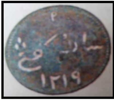
Figure 8. Arabic Coin

Figure 8 shows coin with Arabic script showing Islamic Year 1219 Hijriah = 1804 AD.