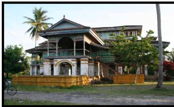
Figure 1. Niat Lima Laras Palace

In colonial era in Indonesia, East Sumatera include Asahan became district with Bengkalis, Riau as the capital city. It was an Afdeling (Regency) Asahan with the controleur in Tanjung Balai [1], and Dutch believed to Batubara Kingdom. At that time the famous kingdom was Datu Muhammad Yuda (Al Sridiraja), as the 12 th ancestor. He was traded to Malacca, Singapore and other places to collect money for building new palace, the Niat Lima Laras Palace (1707-1912). The palace located in Limalaras Village, Tanjung Tiram District, Asahan Regency. After Datu Muhammad Yuda passed away in 1919, the ancestors stayed there, but in 1970 that palace was not took care anymore and no one stayed in the palace.