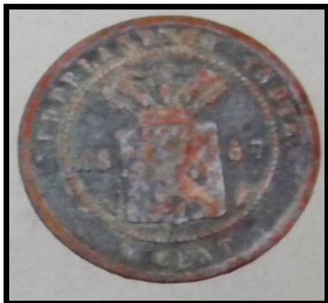
Figure 4. Netherlands East Indies Coins (The Front Side)

Another finding in Bogak boat was some coins made in 1734, 1752, 1760, 1780, 1781, 1788 and 1790.