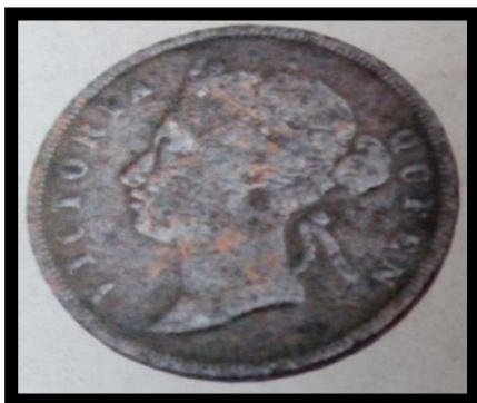
Figure 7. Victoria Queen Coin

In the front side of the coin shown in figure 6 presents English Kingdom symbol, and EIC stands for East India Company (English trade), and also the script 1887 conveying the year, but the back side of the coin is unclear.