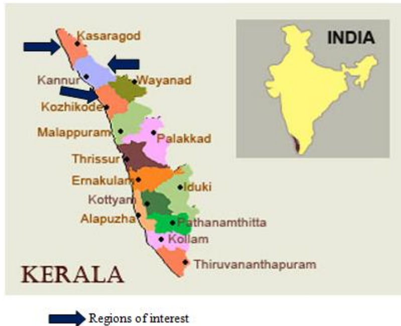
Figure 1. North Malabar in Kerala state, the region in which Thidambu Nritham is a popular temple ritual

in Tamil Nadu, as mentioned in the Sangam literature (between 400 BCE and 300 CE) and Bhakthi movement was introduced in Malabar region [4]. Yet another argument is about Pooram festival in Thrissur districts in central Kerala. Kolathiri King had attended the elaborate festival of Arattupuzha pooram (3000 years old ritual), and thought of introducing an equivalent ritualistic celebration in North Malabar and entrusted temple priests to introduce Thidambu Nritham [5].