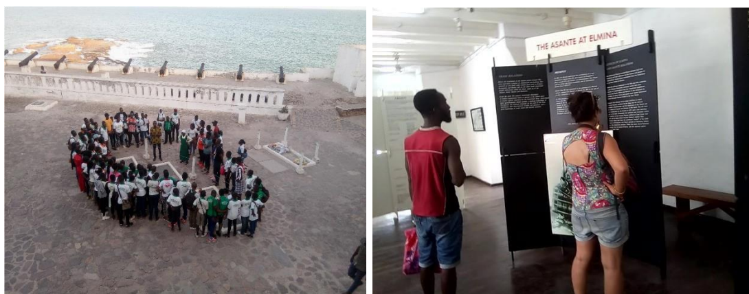
Figure 2. Self-guided and unguided tours at Elmina Castle Museum

Museum education in Ghana takes two forms; either by a guided tour or visitors viewing exhibits without any guide. They create their own meanings by viewing and reading the provenances that have been pasted or mounted closer to work (Figure 2). Sometimes due to a large number of visitors at a particular time, especially on statutory holidays, the visitors enjoy their visit in groups and have discussions on their own. When individuals and smaller group visitors come around, they spend more time reading the panels and relate the text with their experiences to make meanings. In a few cases, the exhibitions are well-curated to give a clear message to the visitor. The text is a narrative of the photograph; cultural description and artistic appreciation all contribute to the education of the visitors. Panels and textual presentations provide a great deal of education to the self-guided visitor. The texts beside or under a particular exhibit provide understanding devoid of any curator or educator's narrative, as seen in figure 3.