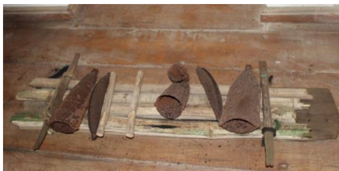
Figure 1. Rusted exhibits of gong-gong and sticks

In most museums in advanced countries, there is a proposed system that employs the ubiquitous visitor model, automatically identifying the required exhibit and providing tailored education to the visitors (Khanwalker & Venkataram, 2021). Museums in Ghana use a simple exhibition style and gallery tours to educate visitors. There is the presentation of texts and panel narrations as subservient to understanding the text. Customarily during a gallery tour, the visitor is caught engaged by the appearance of the display of the exhibits and the textual presentation and audio-visuals, which keep the visitor in an enthusiastic mood and brings a lasting memory. Even though good exhibition practices play, an important role in museum education, poor maintenance and improper presentation affects visitor education and satisfaction, as seen in figure 1 in Fort Apollonia Museum in Axim.