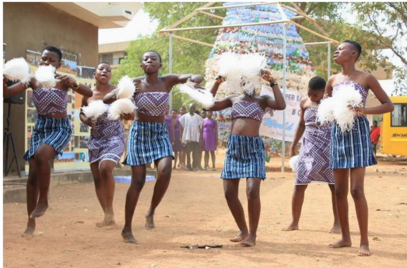
Figure 6. Cultural display by Zuruangu Senior High School