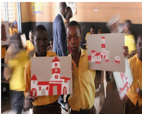
Figure 4. Drawing of Castles by children

Another outreach program is the celebration of World Story Telling Day, which is honored globally on the 20 th of March each year. On this day, as many relevant institutions tell and listen to stories in as many languages at different venues. Participants share and tell cultural stories and historical events. The Upper East Regional Museum in Bolgatanga hosts a program dubbed 'Bolga Tells' each year to educate the visitors on their culture through pupils' cultural displays, as seen in figure 6.