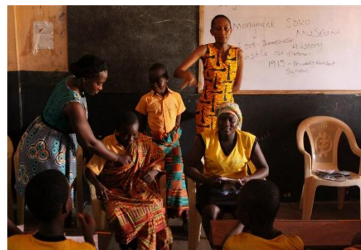
Figure 5. Drama by Children