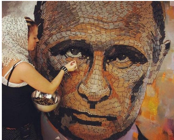
Figure 2. The Face of War by Dariya Marchenko