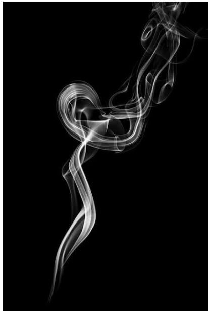
Figure 3. Woman of Smoke by Michal Jesensky

Tools/Equipment: To produce art, the artist has to manipulate the material(s) he chose for his art creation. More often than not, he uses tools/equipment to get that done. Hardly is any artwork produced without the use of the tool(s) and/or equipment, whether crude or sophisticated. Even the Paleolithic man made use of tools for his art creations, as noted by Arbor (2012), that in creating his cave painting the Paleolithic man made use of hand-made brush from a twig, and blowpipes from bird bones, to apply and spray paint respectively onto the cave wall. Tool/equipment forms an indispensable factor of art production as it positively impacts art production. It also opens doors for innovations and the evolution of techniques in art production. Ukim (2019) expounds that given the pace of technological advancement in the world today, new