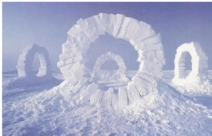
Figure 1. Touching North by Andy Goldsworthy

Art praxis has indeed assumed a greater dimension with limitless materials. As the artist continuously explores his environment, he gets opened to new ideas and techniques which pave the way for the employment of even unconventional materials for art creation. According to Ukim (2019), there is hardly any physical thing that cannot be employed as material for art production. This agrees with Ken (2017)'s observation that in recent times, fugacious materials and other non-traditional materials have equally emerged as media of art creation. The emergence of petrochemicals and their by-products, including things that had existed with man but were not seen as art materials like smoke, meat, and ice, have also joined the league of art materials. This has been seen in the production of works like "Touching North" (1989) - an ice sculpture; "The Face of War" (2015) - a painting produced with bullet casings; and "Woman of Smoke" - an art created from smoke.