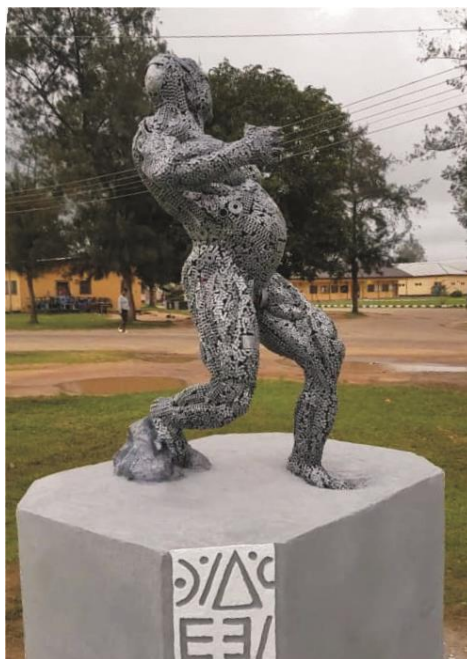
Figure 8. Isolated Being by Odudu Ekanem (Source: Artist Collection)