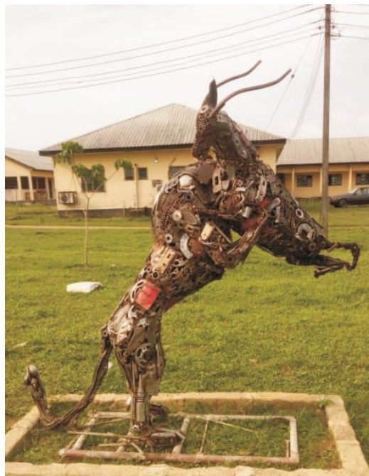
Figure 7. Survival of the Fittest by Rosemary Akwasi