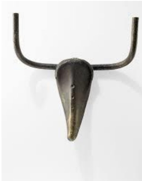
Figure 4. Bull's Head by Pablo Picasso