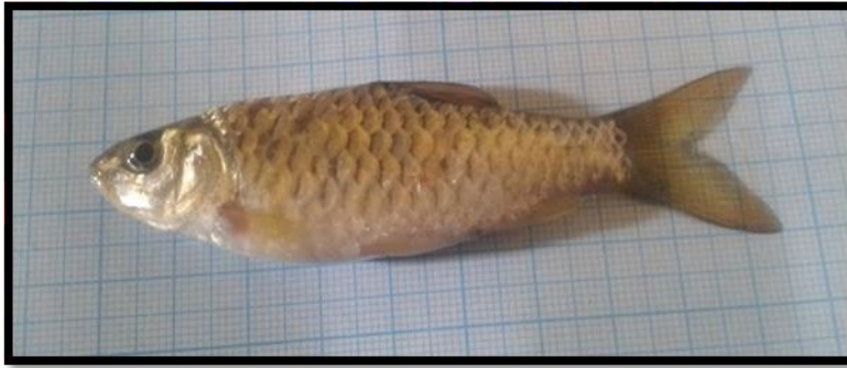
Figure 5 Puntius binotatus

Round and flat body shape, superior mouth type, cycloid scale type, homocercal tail type silvery gray body color. This fish has a total length: 9- 13.4 cm; standard length: 6.9-8.1 cm; head length: 1.5-,2.3 cm; height: 2.3-3.5 cm; tail length: 2.2-4.3 cm; mouth opening width: 0.5- 1.3 cm.