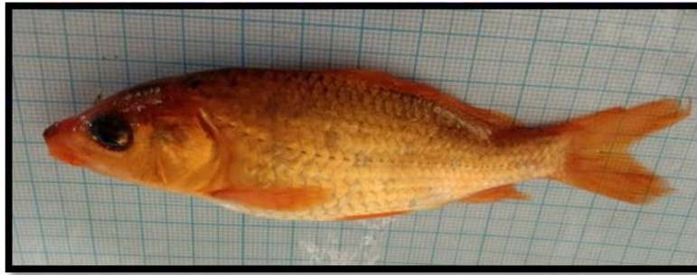
Figure 7 Cyripnus carpio