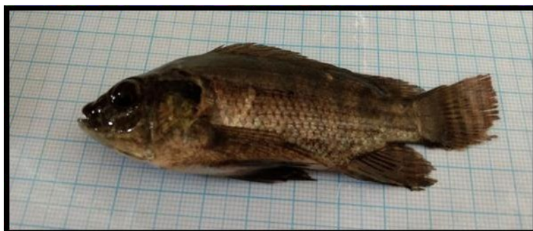
Figure 9 Oreochromis niloticus

The body shape of the fish is flat, the body is covered with brownish scales, terminal mouth type, stenoid scale type, heterocercal tail type. It has an upright line of upright black color on the tail fin and reddish-colored tail fin and several stripes of color bands on the body. This fish has a total length: 10-16.7 cm; standard length: 6-12.2 cm; head length: 1.5-2.1 cm; height: 3-4 cm; tail length: 0.8-1.5 cm; width of mouth opening: 0.5- 1 cm.