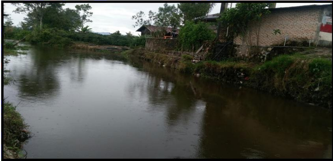
Figure 3 Research location at Station 3