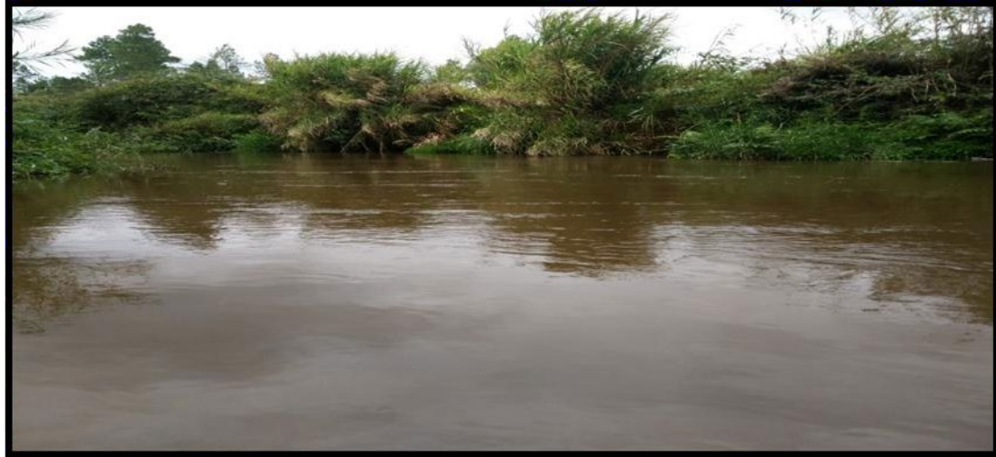
Figure 1 Research location at Station 1

This station is an activity-free area located in Matiti Village, the base substrate at this location is in the form of rocks and sand geographically located at 2^{\circ} 15'23'' N LU and 98^{\circ} 44' 45'' BT as in Figure 1.