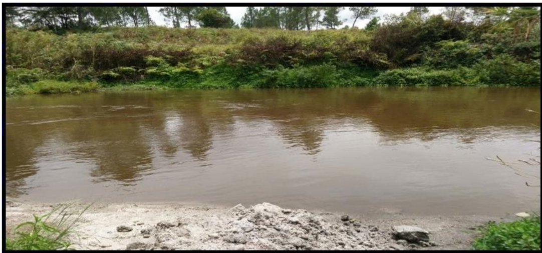
Figure 4 Research location at Station 4

This station is a sand-dredging area located in the village of Lumban Purba, the basic substrat at this location rocks and sandy geographically trletak at 2^{\circ} 13' 36'' LU and 46^{\circ} 54' 98'' BT as in Figure 4.