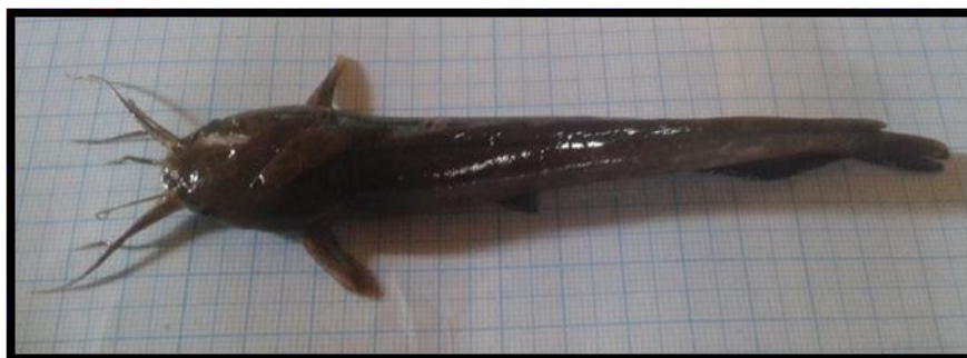
Figure 11 Clarias tjesmani

The body shape of the fish is slightly flattened, slippery, elongated and has a kind of long mustache, sticking out from around the mouth. Anal fin, tail fin and pungung fin do not come together. This fish has a total length: 12.5-16.2 cm; standard length: 8.1-12.2 cm; head length: 2-2.1 cm; height: 2-2.1 cm; tail length: 1.4-2 cm; width of mouth opening: 0.4-0.8 cm..