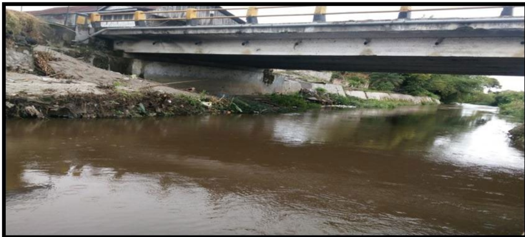
Figure 2 Research location at Station 2

This station is a tofu waste disposal area located in Desa Sihite, the base substrate at this geographically muddy location is located 2^{\circ} 15'24'' N LU and 98^{\circ} 44' 90'' BT as in Figure 2.