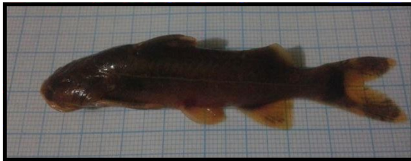
Figure 10 Mystus nemurus

Body shape anguilliform, inferior mouth type, homocercal tail type, flat flat head of slightly flattened body and elongated black and slippery. The body of the fish is covered by thick petals on the jaws there are 3-4 pairs of long touch breech, short dorsal fins, have a pair of patils and have additional dorsal fins or fat fins. The tail fin is alert and is not related to the dorsal fin or anal fin. The anal fin is short and the pectoral fin has very strong hard fingers and jagged. This fish has a total length: 9.2-13.3 cm; standard length: 5-9 cm; head length: 1.5-2.4 cm; height: 2.1-3.5 cm; tail length: 1.6-2.7 cm; width of mouth opening: 1.2-2.2 cm.