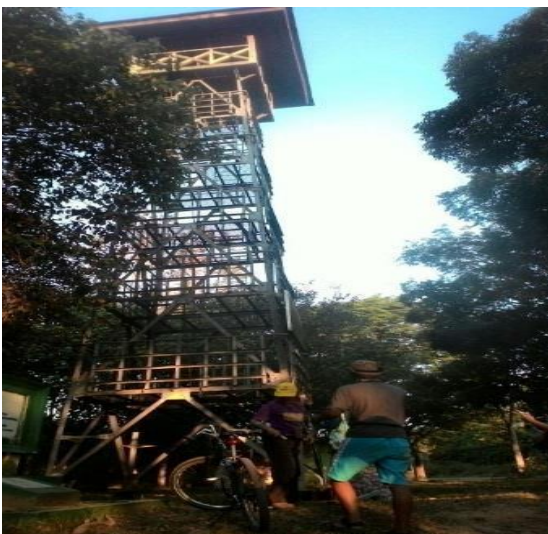
Figure 5. watch tower in Margahayu Resort