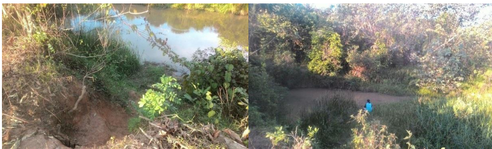
Figure 3. Active wild sumatran elephant tracks and entrance point to Margahayu, Labuhan Ratu VII, East Lampung and for local fishing activities.