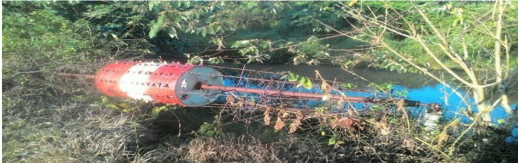
Figure 4. Spiny drum, deterrence tool in wild elephant active entrance track to Margahayu, Labuhan Ratu VII