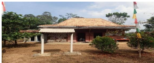
Figure 2. . Conservation house as Biology Department Universitas Lampung, Margahayu, Labuhan Ratu VII