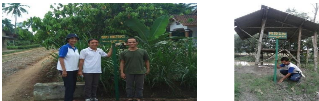
Figure 10. name board in potential ecotourism points Margahayu Resort and direction to Rumah Konservasi Margahayu, Labuhan Ratu VII

Jungle track survey was done along the border lane of Margahayu – WKNP. The track choice was expected to fulfill local people wish as well as its safety. This tracks also represented the unique landscape of Margahayu. Potential point tagging and direction was using the name board (Figure 10).