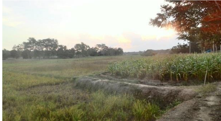
Figure 7. The beauty and uniqueness of Margahayu landscape directly next to WKNP

Community based conservation is the most practical approach to slow down the lost of biodiversity in developing countries (Mehta and Kellert, 1998). From further survey and discussion, there were potential jungle track in Margahayu Resort (Figure 8), next to WKNP border lane. It is separated from conservation area by 2 meter wide canal, 3 meter deep. Along this jungle track there are wild elephant entrance point to Margahayu, showed by elephant slipped tracks. This indirect signs of wild Sumatran elephant can be a natural tool for conservation education and awareness.