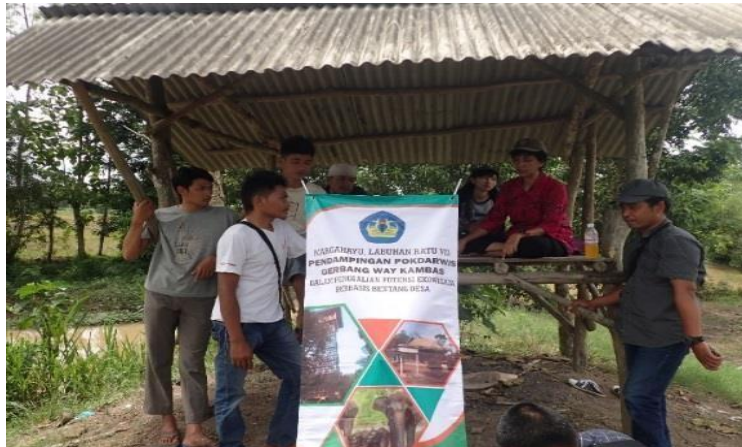
Figure 9. Margahayu Resort post, Labuhan Ratu VII

Jungle track survey was done along the border lane of Margahayu – WKNP. The track choice was expected to fulfill local people wish as well as its safety. This tracks also represented the unique landscape of Margahayu. Potential point tagging and direction was using the name board (Figure 10).