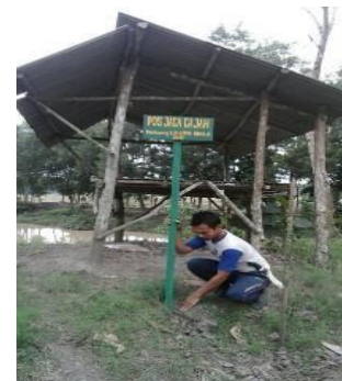
Figure 10. name board in potential ecotourism points Margahayu Resort and direction to Rumah Konservasi Margahayu, Labuhan Ratu VII