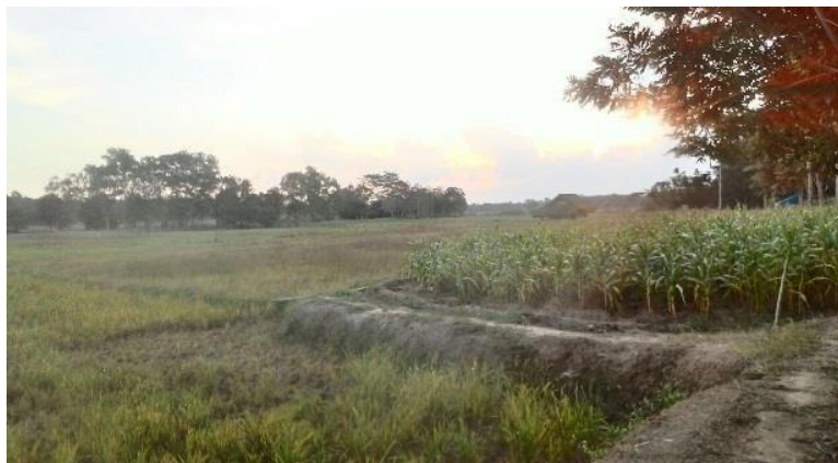
Figure 7. The beauty and uniqueness of Margahayu landscape directly next to WKNP

Community based conservation is the most practical approach to slow down the lost of biodiversity in developing countries (Mehta and Kellert, 1998). From further survey and discussion, there were potential jungle track in Margahayu Resort (Figure 8), next to WKNP border lane. It is separated from conservation area by 2 meter wide canal, 3 meter deep. Along this jungle track there are wild elephant entrance point to Margahayu, showed by elephant slipped tracks. This indirect signs of wild Sumatran elephant can be a natural tool for conservation education and awareness.