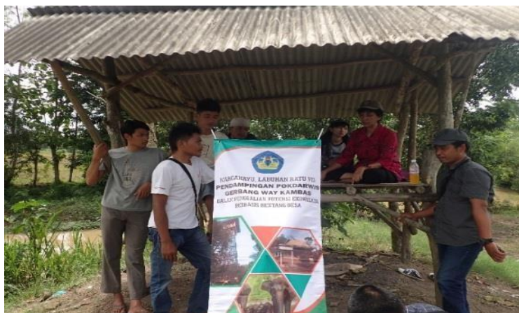
Figure 9. Margahayu Resort post, Labuhan Ratu VII

Jungle track survey was done along the border lane of Margahayu – WKNP. The track choice was expected to fulfill local people wish as well as its safety. This tracks also represented the unique landscape of Margahayu. Potential point tagging and direction was using the name board (Figure 10).